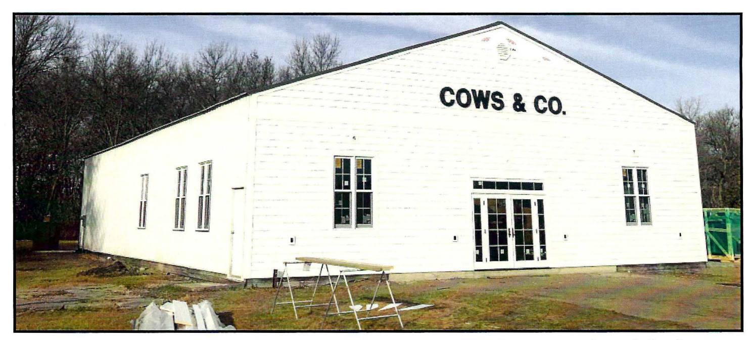
Progress on Cows & Co. Creamery

Farm Diversification Grants give priority to projects dealing with the diversification of a family farm to non-traditional crops, livestock, or on-farm, value-added processing of agricultural commodities. Traditional crops and livestock are generally defined as those that the North Dakota Agricultural Statistics Service maintains statistics on. The project must have the potential to create additional income for the farm unit.