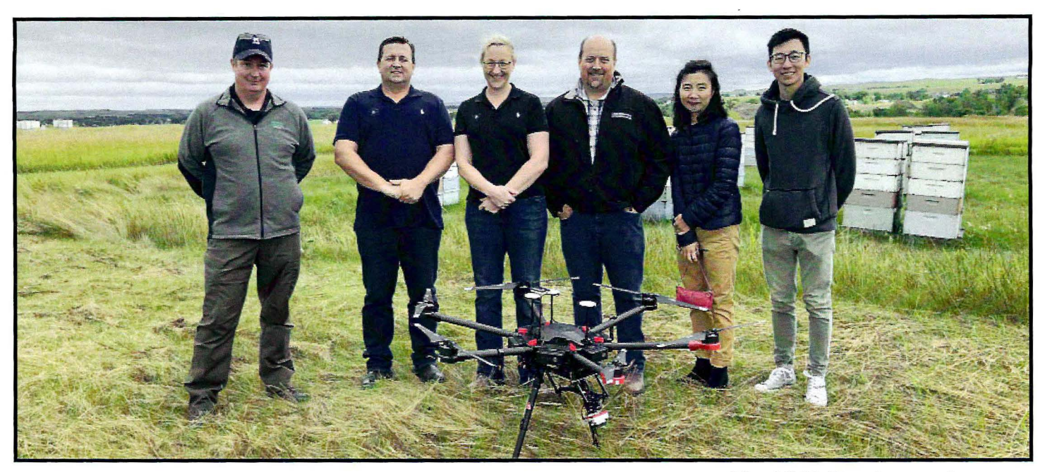
The UND-Bee Innovative team

Basic & Applied Research Grants assist in research for processing agricultural products and byproducts in North Dakota. These grants cannot be aimed at business expansion or creation without regard to agricultural products, must not include research that cannot reasonably be expected to result in a marketable product, or cannot have been duplicated by other research efforts.