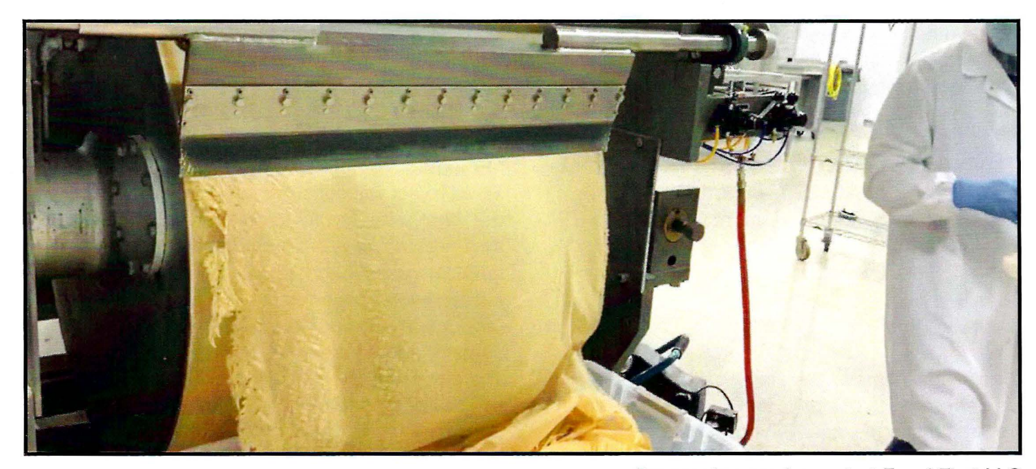
Processing equipment at Food First LLC

Marketing & Utilization Grants provide necessary assistance to the research and marketing needs of the state by developing new uses for agricultural products and by-products, and by seeking efficient systems for processing and marketing these products. These grants are also used to promote efforts that increase productivity, provide added value to agricultural products, stimulate and foster agricultural diversification and encourage processing innovations.