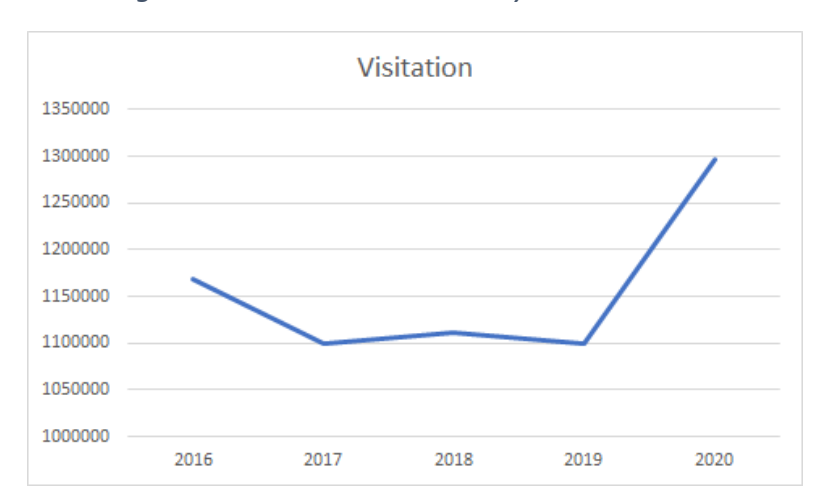
Figure 1 State Park Visitation by Calendar Year

In addition to the state park visitation, 88,075 people utilized facilities at the Lewis & Clark Interpretive Center and Fort Mandan in 2020 with 5,886 paid admissions.