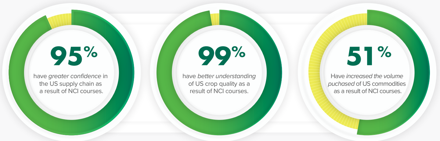
● - Yes ● - No Survey response from 104 course participants from the 18-19 calendar year

The Northern Crops Institute offers a variety of courses, webinars, and handbooks that unite customers, commodity traders, technical experts, and professors for discussion and education. During our courses, participants can expect to refresh their expertise and be exposed to existing and new technology, participate in lectures, case histories, laboratory demonstrations and tours and hear from industry experts, government officials and university professors.