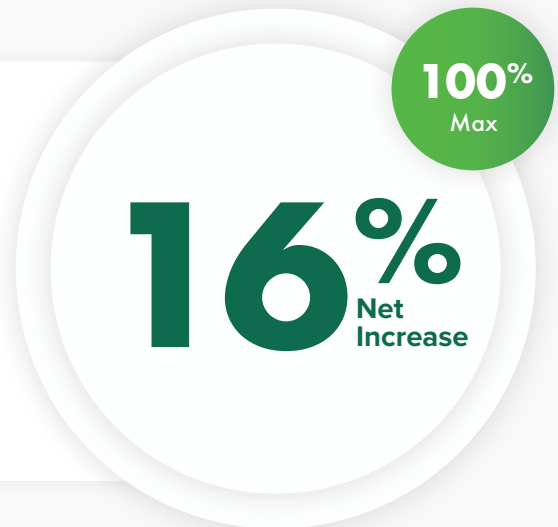
Survey response from 15 technical service clients from the 18-19 calendar year

Our research shows that clients have increased their overall investment activity by 16% within ND, MN, MT, and SD after their experience working with NCI.