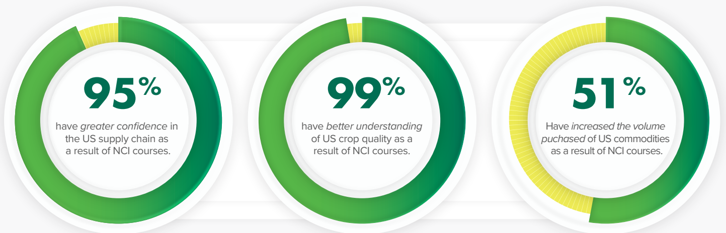
● - Yes ● - No Survey response from 104 course participants from the 18-19 calendar year

The Northern Crops Institute offers a variety of courses, webinars, and handbooks that unite customers, commodity traders, technical experts, and professors for discussion and education. During our courses, participants can expect to refresh their expertise and be exposed to existing and new technology, participate in lectures, case histories, laboratory demonstrations and tours and hear from industry experts, government officials and university professors.