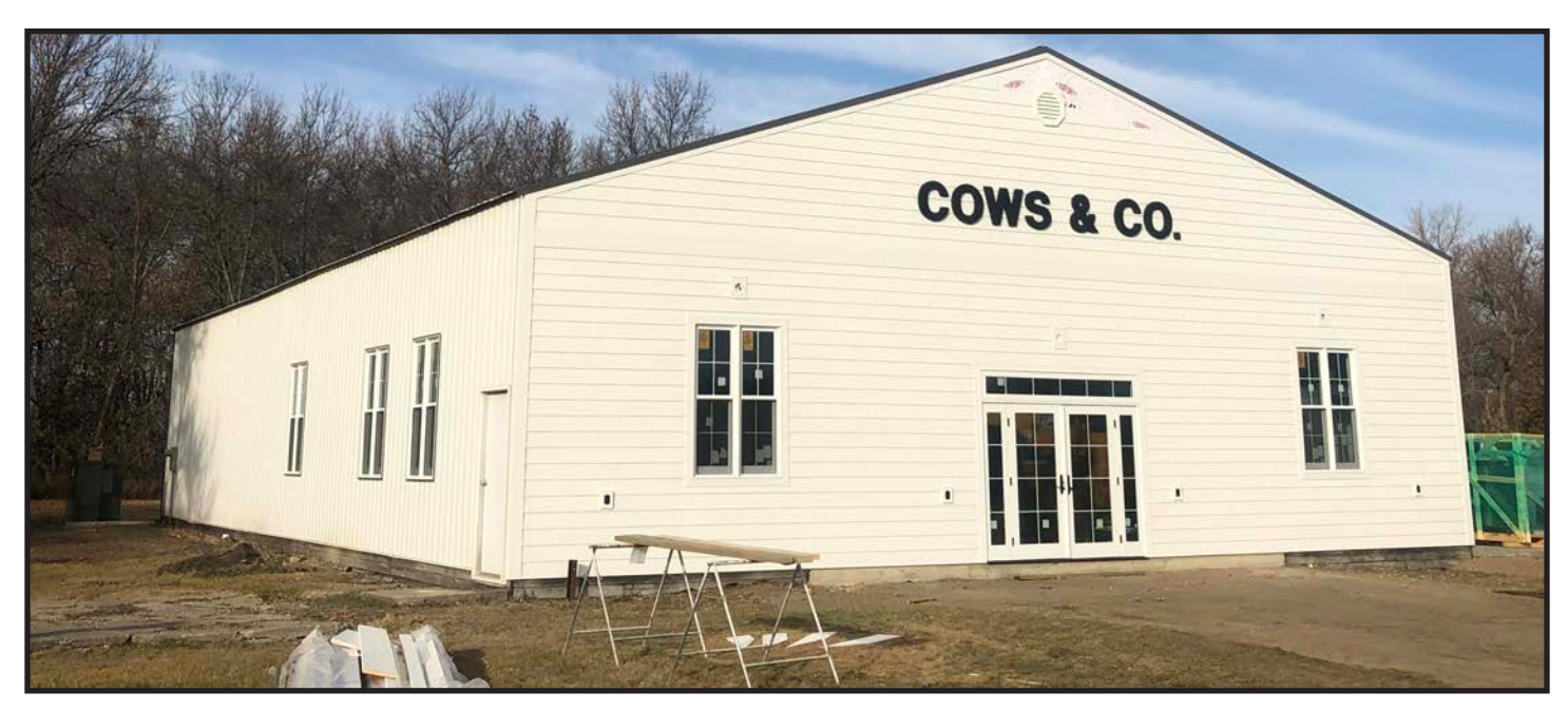
Progress on Cows & Co. Creamery

Farm Diversification Grants give priority to projects dealing with the diversification of a family farm to non-traditional crops, livestock, or on-farm, value-added processing of agricultural commodities. Traditional crops and livestock are generally defined as those that the North Dakota Agricultural Statistics Service maintains statistics on. The project must have the potential to create additional income for the farm unit.