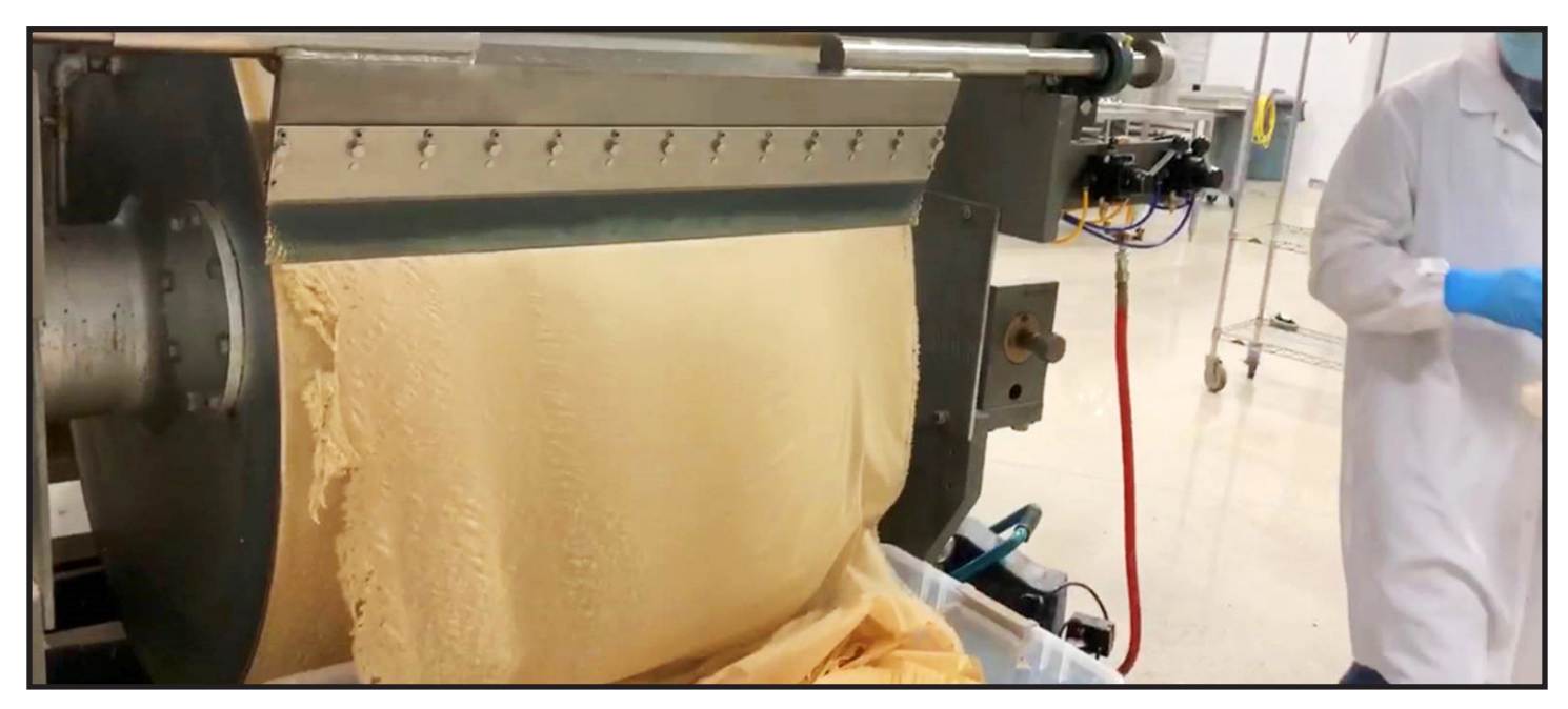
Processing equipment at Food First LLC

Marketing & Utilization Grants provide necessary assistance to the research and marketing needs of the state by developing new uses for agricultural products and by-products, and by seeking efficient systems for processing and marketing these products. These grants are also used to promote efforts that increase productivity, provide added value to agricultural products, stimulate and foster agricultural diversification and encourage processing innovations.