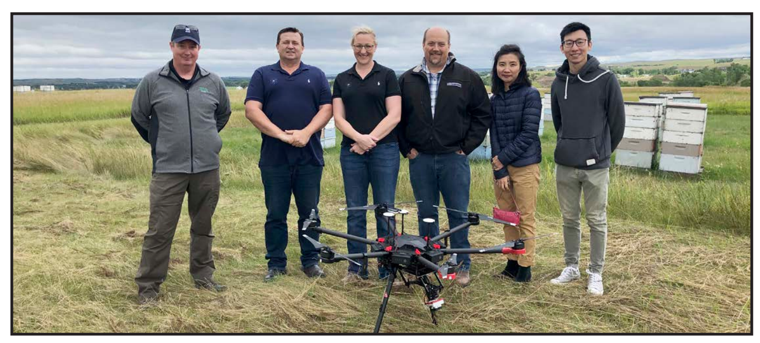
The UND-Bee Innovative team

Basic & Applied Research Grants assist in research for processing agricultural products and byproducts in North Dakota. These grants cannot be aimed at business expansion or creation without regard to agricultural products, must not include research that cannot reasonably be expected to result in a marketable product, or cannot have been duplicated by other research efforts.