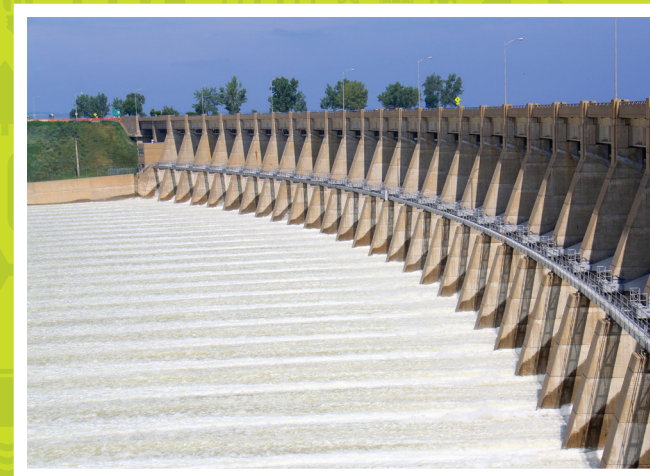
North Dakota Section of the American Society of Civil Engineers

INFRASTRUCTUREREPORTCARD.ORG/NORTH-DAKOTA