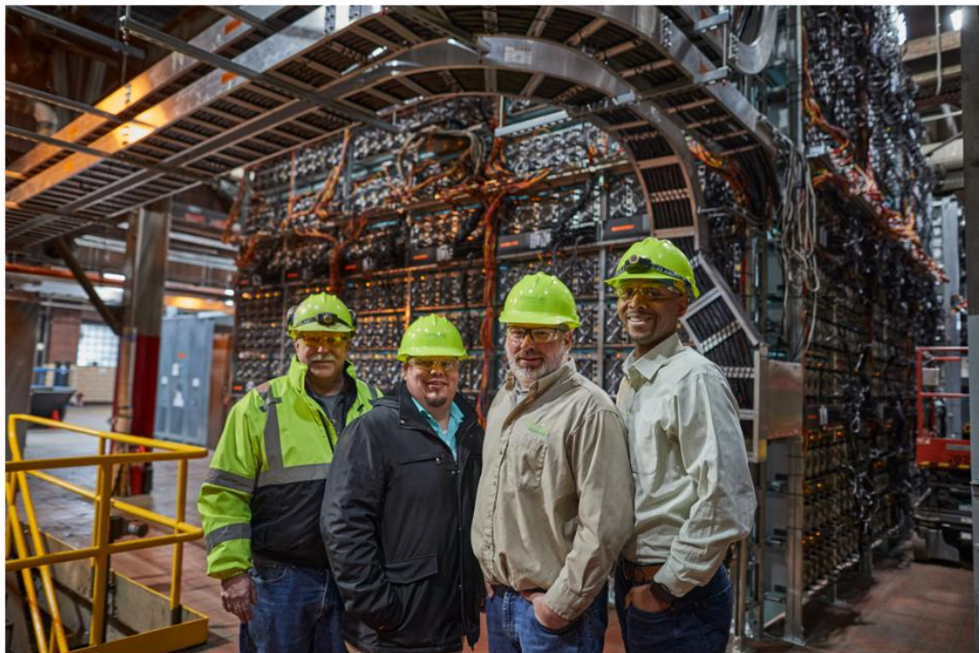
Bitcoin mining at 20MW, the Team at Greenidge located in the Finger Lake Region of New York State, ... [+] GREENIDGE

I report on the adoption of cryptocurrency, stablecoin and blockchain.