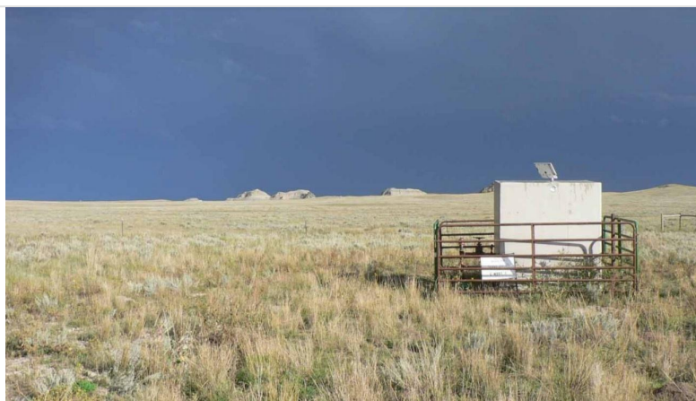
One of the orphaned Spyglass natural-gas wells.