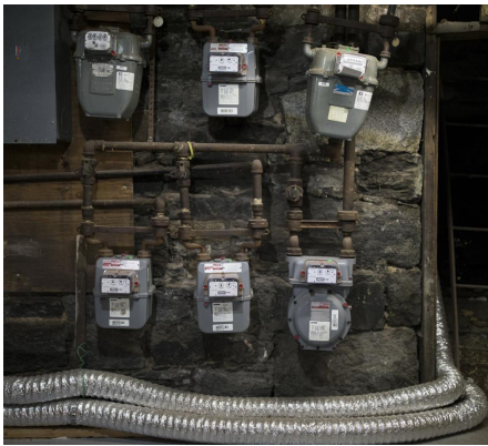
BROOKLYN, NEW YORK - JULY 4: Six meters placed by National Grid measure natural gas consumption in a ... [+]

Greenidge Generation is a former coal-fired electrical power plant that has converted to natural gas. They supply electrical power to New York State's residents. Every day Greenidge has to bid in a competitive power market – sometimes, they make a profit when energy demand is higher. The company has been in business since 1937 but, in the last decade, suffered against cheaper power sources. The facility was mothballed in March 2011. Competition from cheaper shale natural gas supplies and coal exports from China put the old company into economic distress. Atlas Holdings bought the plant in 2014 and converted it to natural gas in 2017.