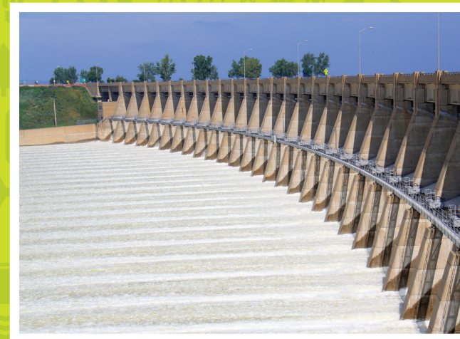
North Dakota Section of the American Society of Civil Engineers

INFRASTRUCTUREREPORTCARD.ORG/NORTH-DAKOTA