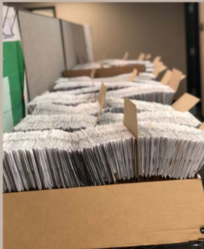
Picture depicts a portion of the ballots received

26,568 Ballots Mailed 12,438 Ballots Received