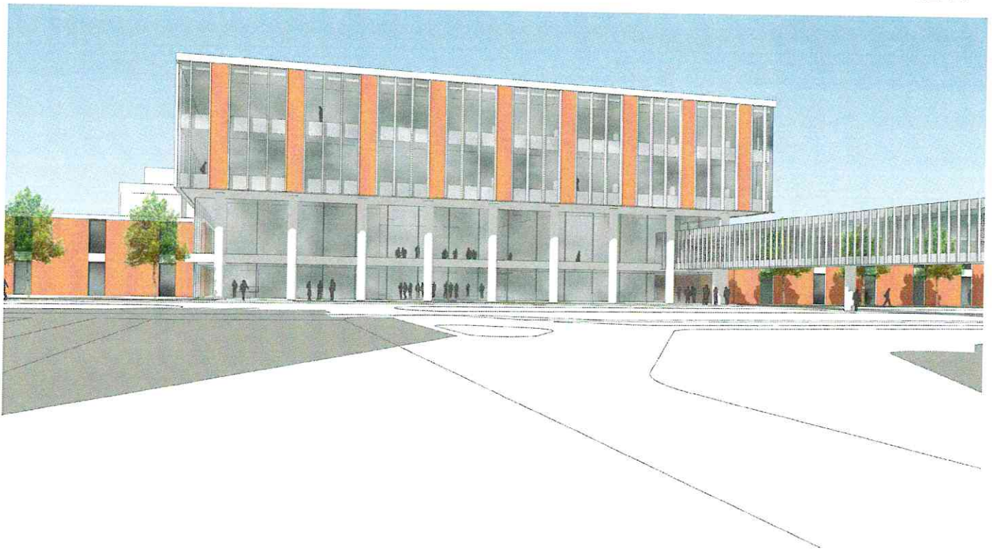
NORTH DAKOTA STATE UNIVERSITY | ENGINEERING 16 AUGUST 2022 | 05/05 2555 01/02