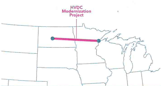
HVDC Modernization Project

North Plains Connector A 3000 MW HVDC project, under development by Grid United and ALLETE, will bridge the gap between the eastern and western interconnections, linking Colstrip in Montana to central North Dakota.