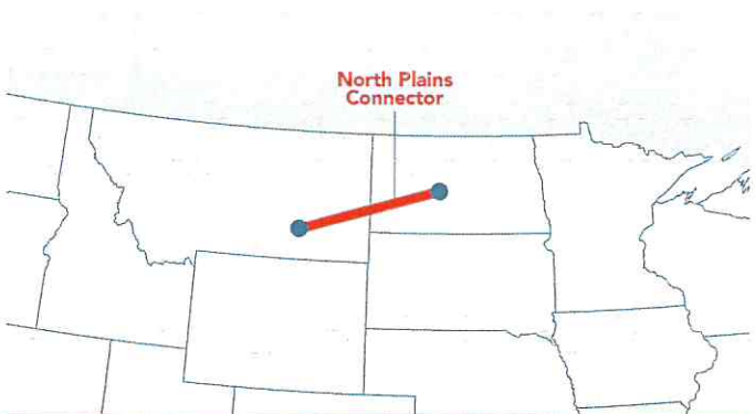
North Plains Connector

Colstrip Upgrades Colstrip transmission assets in Montana and Washington will be utilized along with upgrades currently under study to improve capacity from Montana to points west.