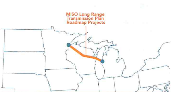
MISO Long Range Transmission Plan Roadmap Projects

HVDC Modernization Project Minnesota Power is upgrading its existing 465 mile HVDC system from ND to MN to expand capability from 550 MW to 900 MW. Future opportunity to expand further is being investigated.