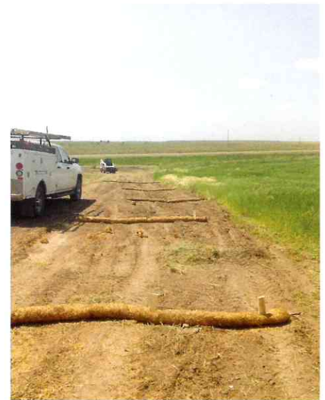
Same site after reclamation