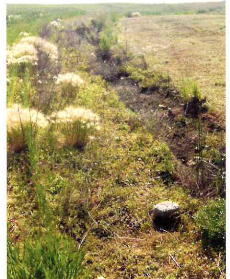
Site prior to reclamation

Provide final report to the agriculture commissioner