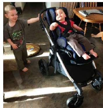
Awesome Zippie adaptive stroller.