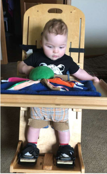
Old school stander