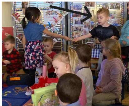
Sitting with aide on lap instead of floor with peers.