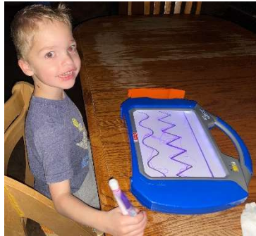
Lights board tracing.