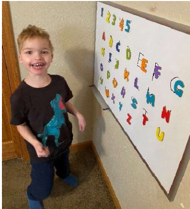
Numbers and Letters