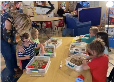
IEP in corner instead of being taught to work with peers.

I don't even want to cover my struggles with putting him in head start and the New Salem school system after all the work I have done and the past year that just happened with them. I will make 2 comments though. This is the year my personal health took a turn for the worse due to the stress they caused and the severe regression we experienced. I literally started losing my hair and is a year I wish to forget. That is year 5. 2022