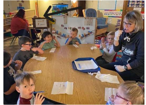
In corner with aide instead of with peers.