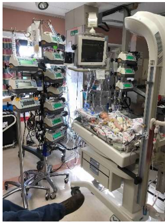
10 days olds. 2 hours after surgery.