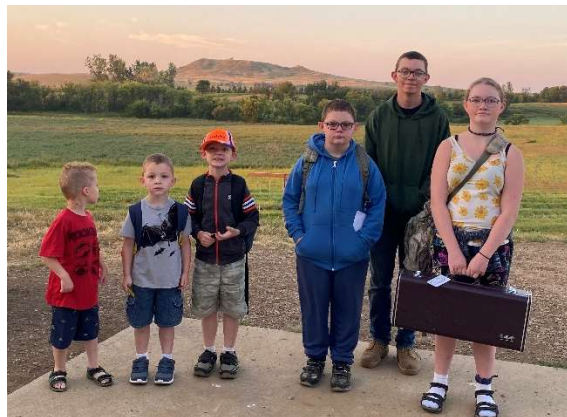
1st Day School 2022