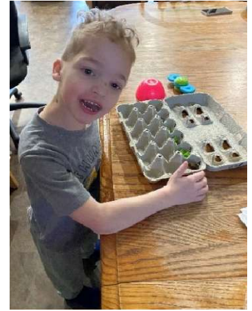
Learn to count.