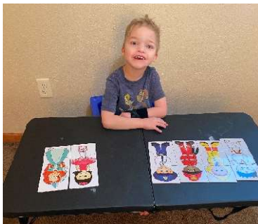
Who Am I Puzzle.