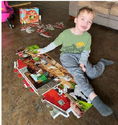
Barn farm animal puzzle.