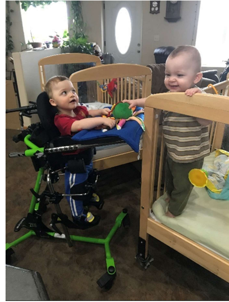
Brand new stander, thanks to BCBS and tons of appointments and referrals.