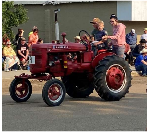
Almont Parade August, Benat and Respite (Kyarra)