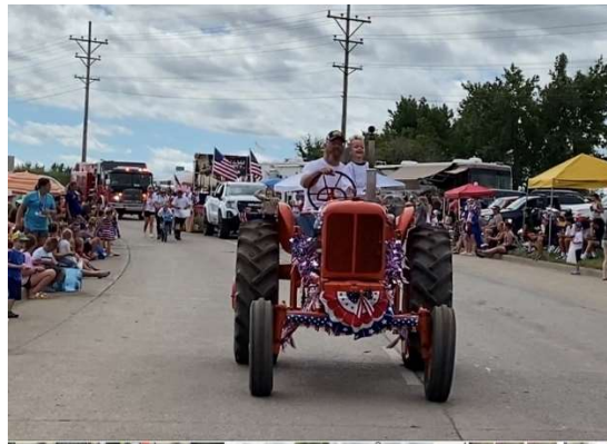
Independents Day Parade Mandan 2022 - Cloverdale