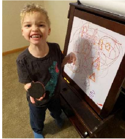
Learn to hold marker.