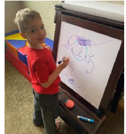
I can draw a face!