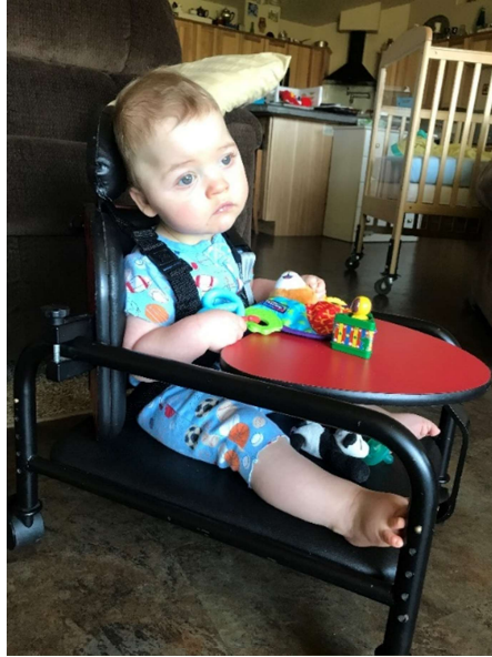
Learning to sit