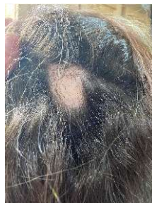
My hair loss due to stress.