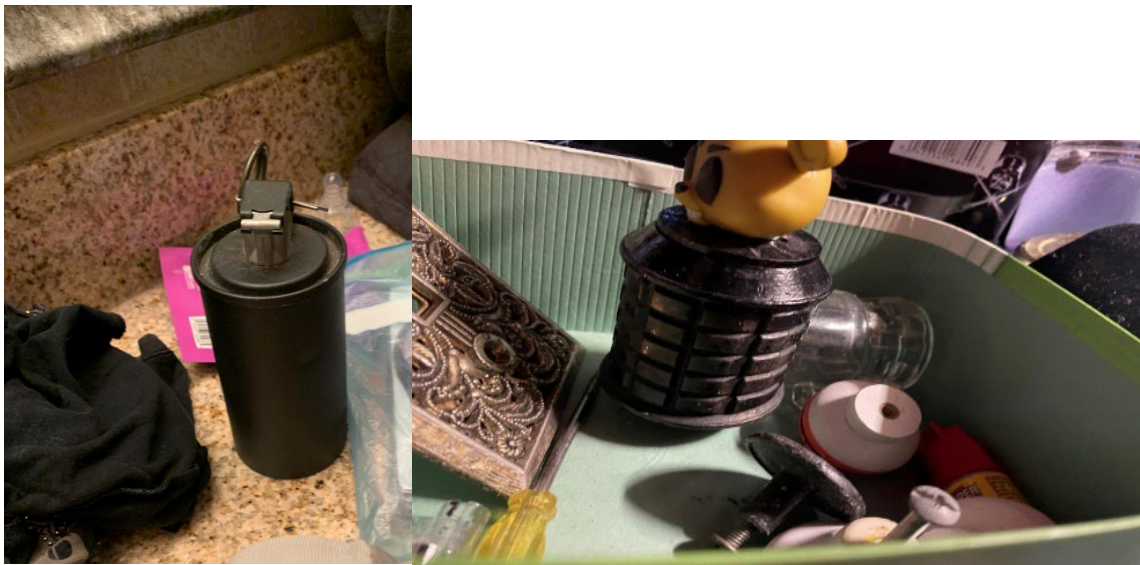
Figure 4: Two live explosive devices found by parole officers