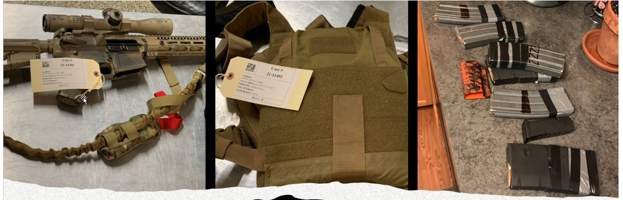
Figure 1 AR-10 rifle, body armor, loaded magazines found by a parole officer