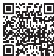
Scan to View Crown Point's Testimonial