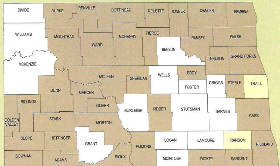
County Status Map