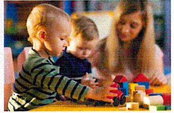
North Dakota Health and Human Services is partnering with ND employers on a pilot program to help reduce the costs of child care for working parents.

North Dakota child care program implements additional benefits Parents and child care providers eligible for assistance will see cheaper co-pays, more funding opportunities and additional incentive programs.