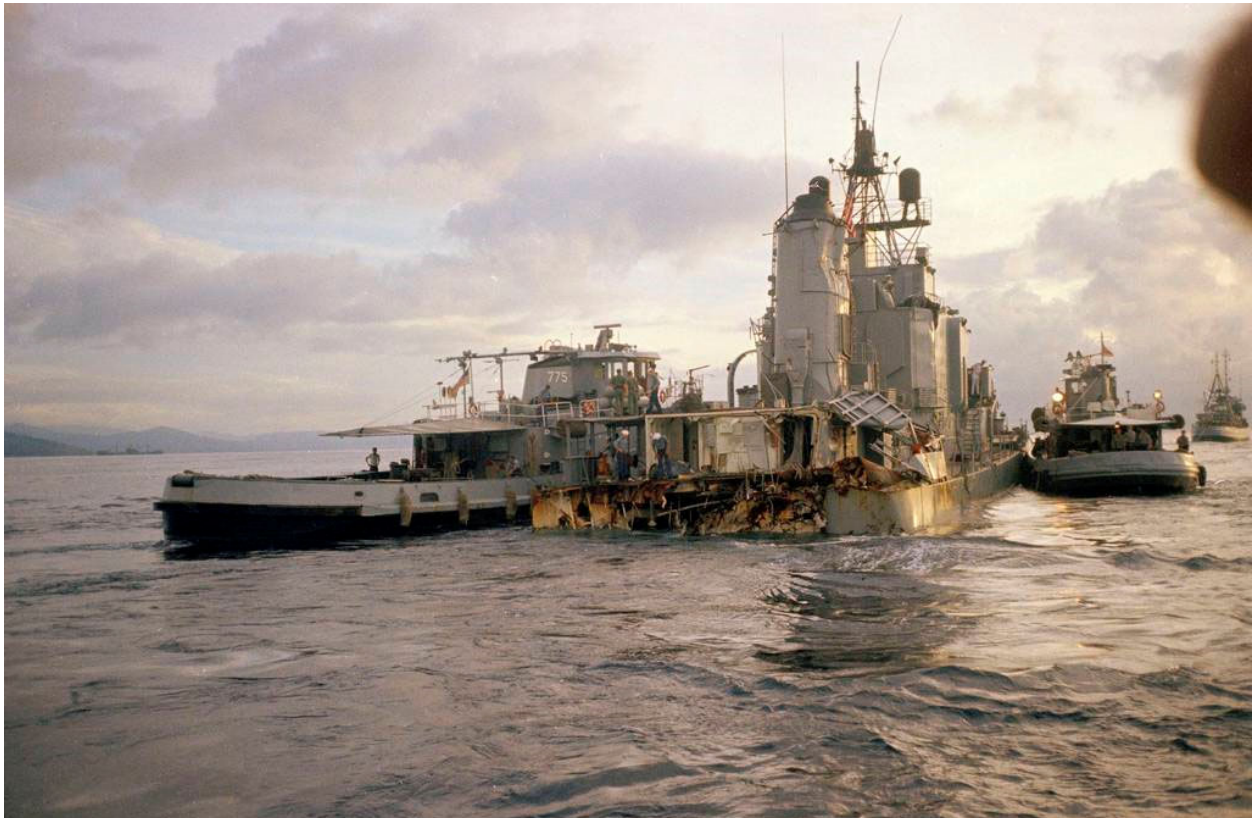
Sailors inspect damage to the U.S. Navy destroyer Frank E. Evans after it was cut in half in a collision with the light aircraft carrier Melbourne of the Royal Australian Navy in the South China Sea, 650 miles southwest of Manila, June 3, 1969.

at 8°59.2'N 110°47.7'E Coordinates: 8°59.2'N 110°47.7'E . [11] After the collision, Frank E. Evans's bow drifted off to the port side of Melbourne and sank in less than five minutes, taking 73 of her crew with it. One body was recovered from the water, making a total of 74 dead. [12] Her stern scraped along the starboard side of Melbourne , and Melbourne's crew attached lines to it. It remained afloat. Around 60 to 100 men were rescued from the water.