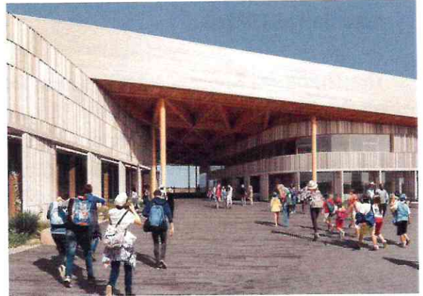
Coming soon... Theodore Roosevelt Presidential Library