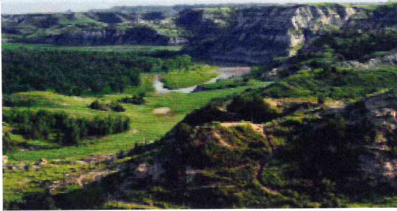
Theodore Roosevelt National Park, North Dakota