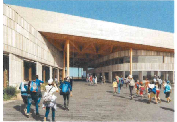
Coming soon... Theodore Roosevelt Presidential Library