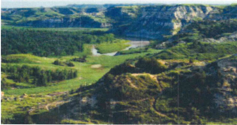
Theodore Roosevelt National Park, North Dakota