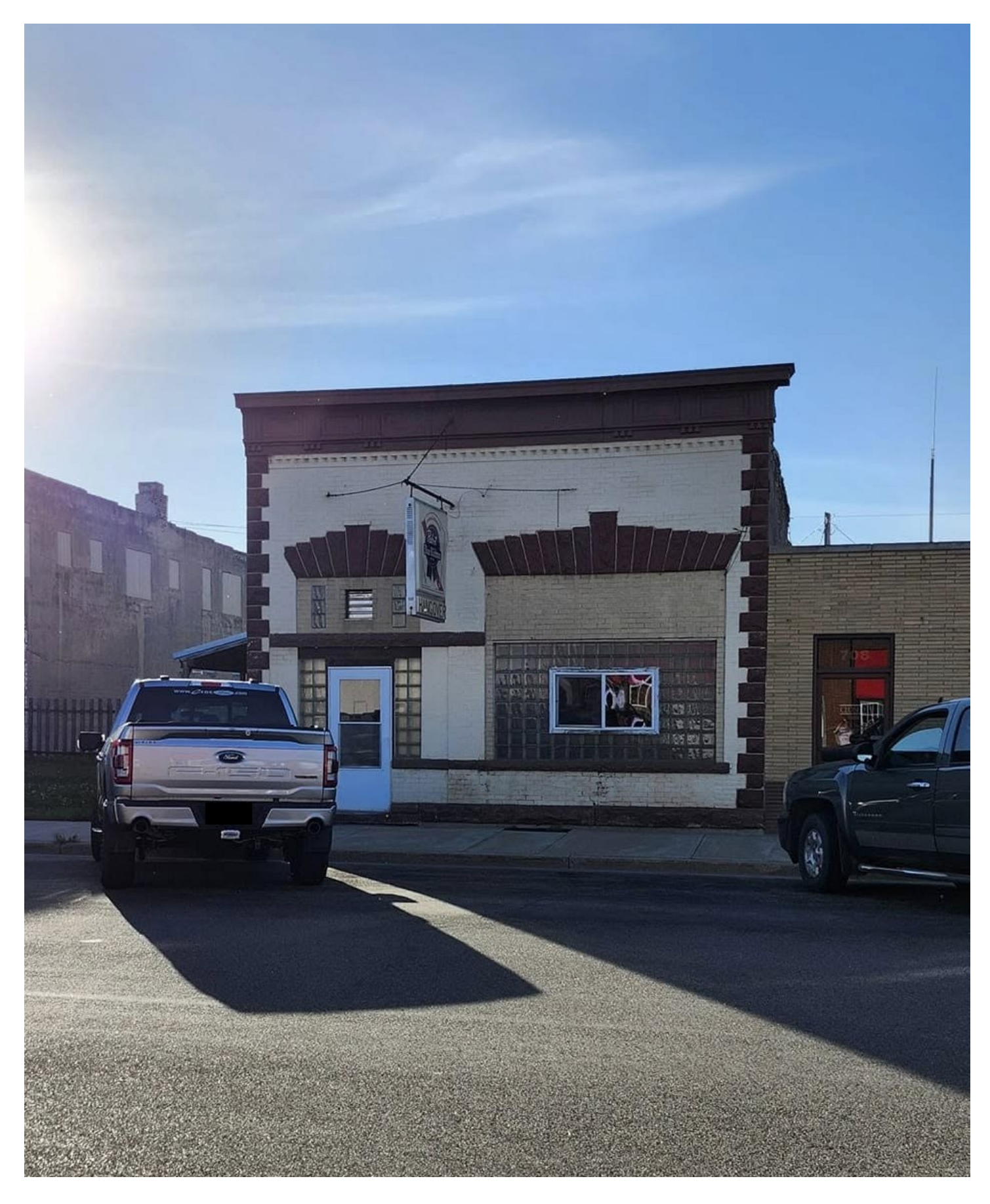
(FUTURE OFFICE, BROMKE LAW FIRM)