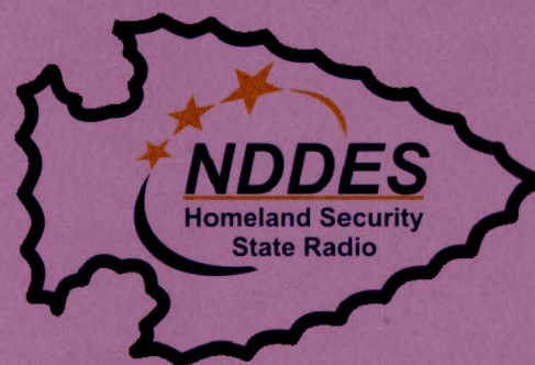
Department of Emergency Services Homeland Security & State Radio