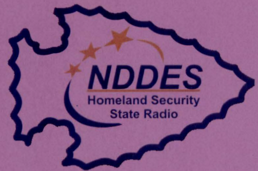
Department of Emergency Services Homeland Security & State Radio