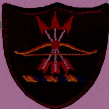
Army National Guard