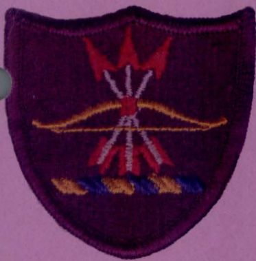
Army National Guard