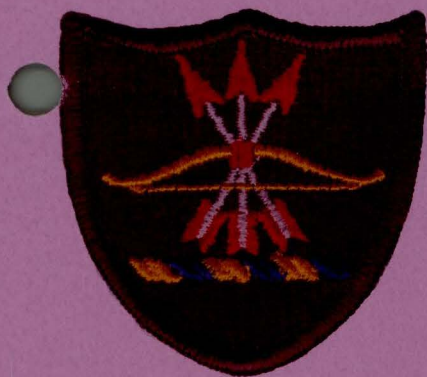
Army National Guard