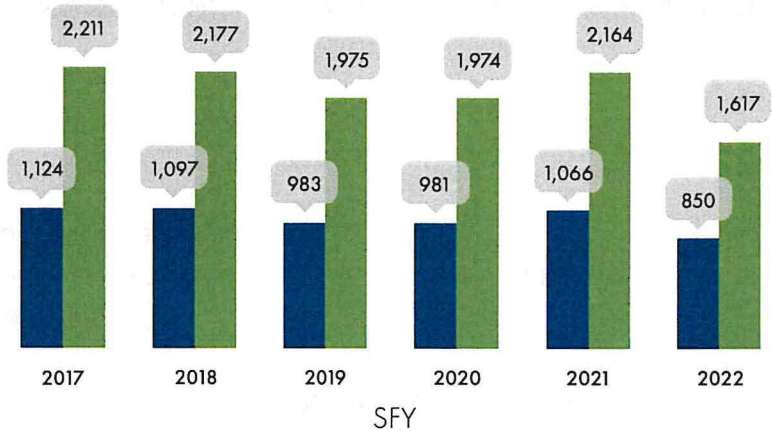
Average Number of Families and Children Served Monthly by State Fiscal Year