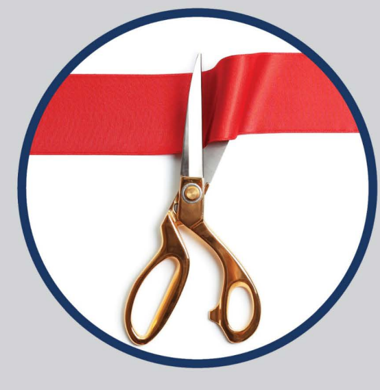
Eliminates red tape