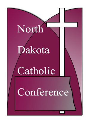
Representing the Diocese of Fargo and the Diocese of Bismarck

103 South Third Street Suite 10 Bismarck ND 58501 701-223-2519 ndcatholic.org ndcatholic.org