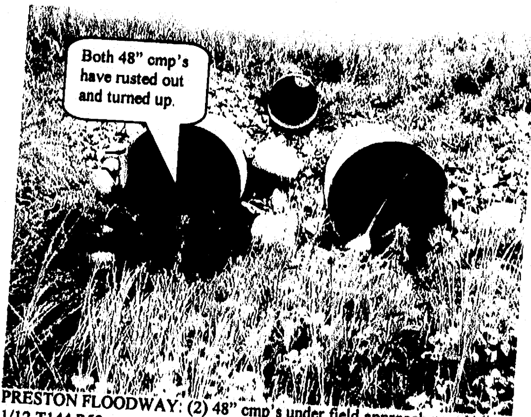
PRESTON FLOODWAY: (2) 48" cmp's under field approach near 1/4 line between 1/12 T144 R52