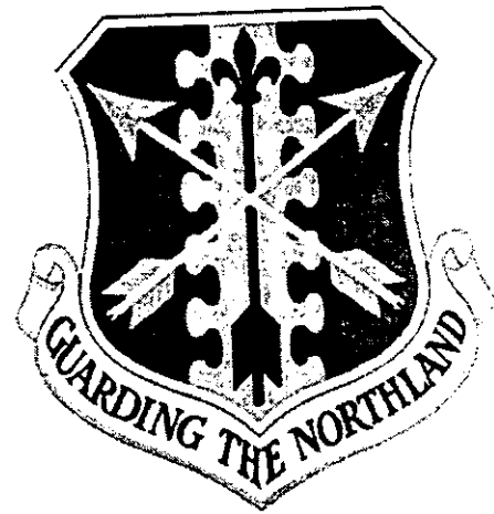
Air National Guard "The Happy Hooligans"