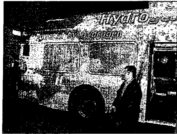
H 2 Hybrid bus in MB

In fact, the city of Winnipeg is already cold-weather testing a hydrogen-powered hybrid bus this month and running it in regular revenue service. They plan to have a permanent hydrogen station as the northern anchor of the Northern H starting in 2006.