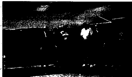
164th INFANTRY ASSOCIATION MEMORIAL NORTH DAKOTA VETERANS CEMETERY MANDAN, NORTH DAKOTA

(top) 164th Infantry Regimental Crest (Je Suis Pret) translates "I am Ready" (bottom) The Americal Division shoulder patch, a blue shield with white stars