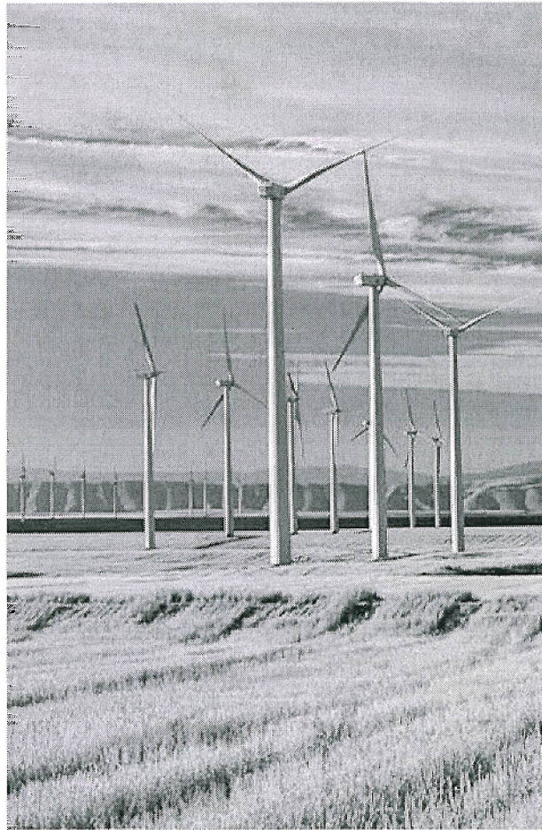
Wind Farm – Sherman County, OR