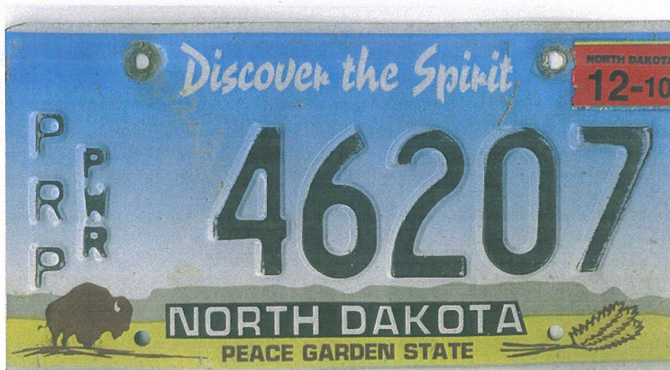
Commercial Carrier License plate