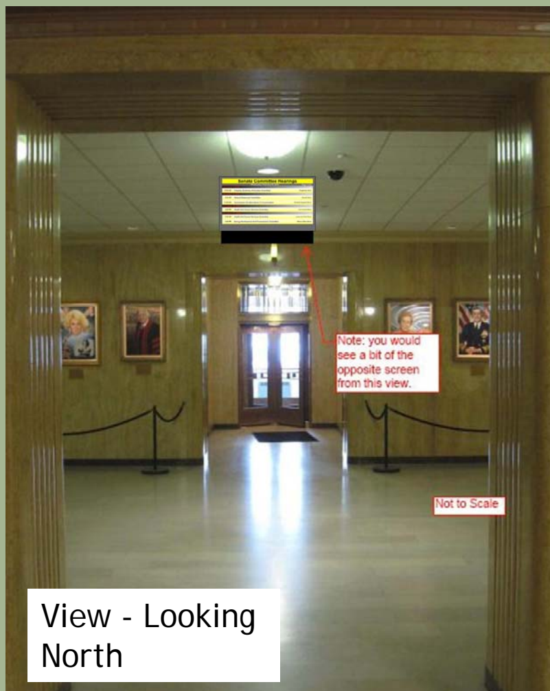
View - Looking North