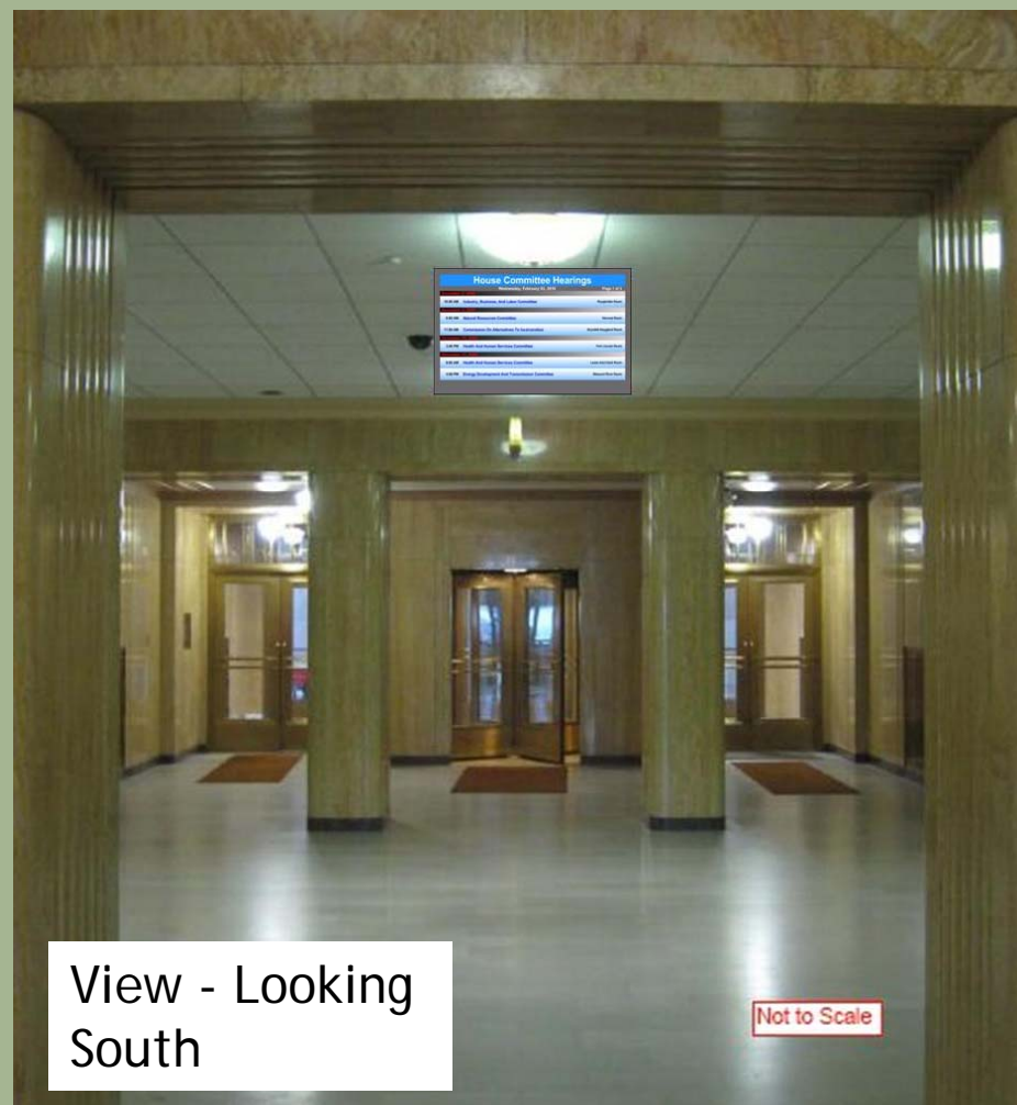
View - Looking South