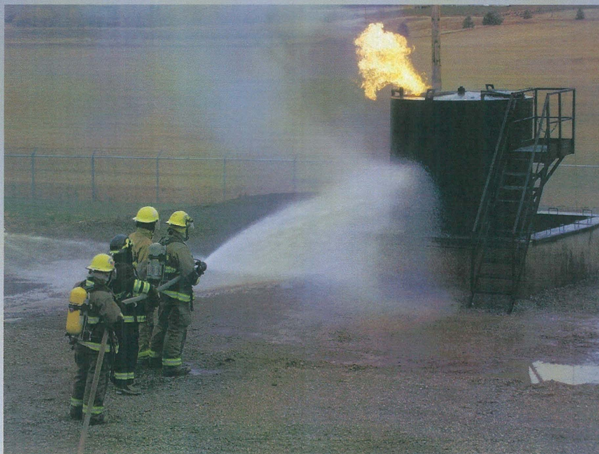
Williston Basin Oilfield Fire Training Dickinson, ND