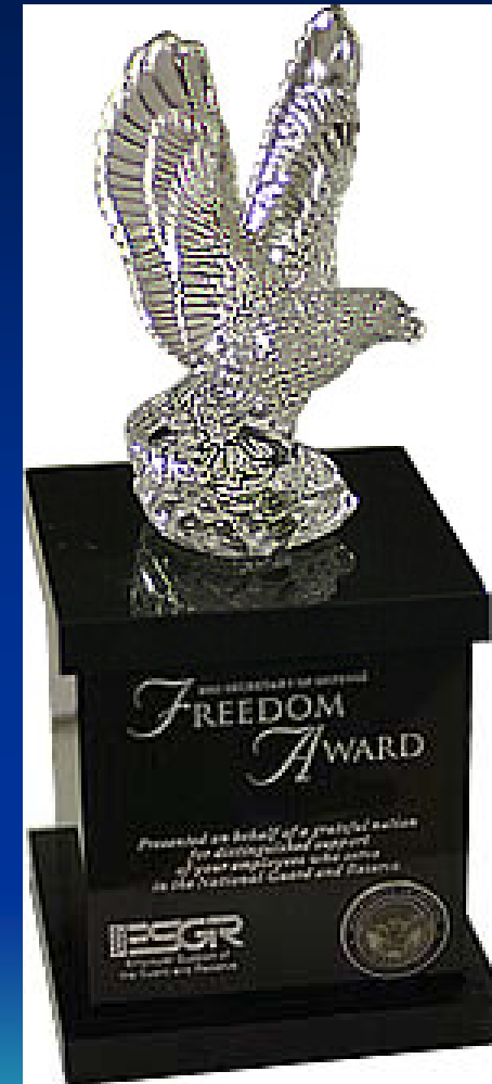
Secretary of Defense Employer Support Freedom Award