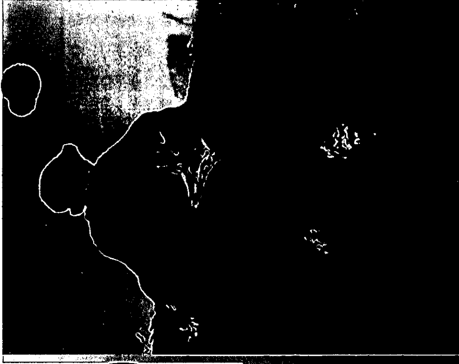
The Sower, 1850. Jean-Francois Millet