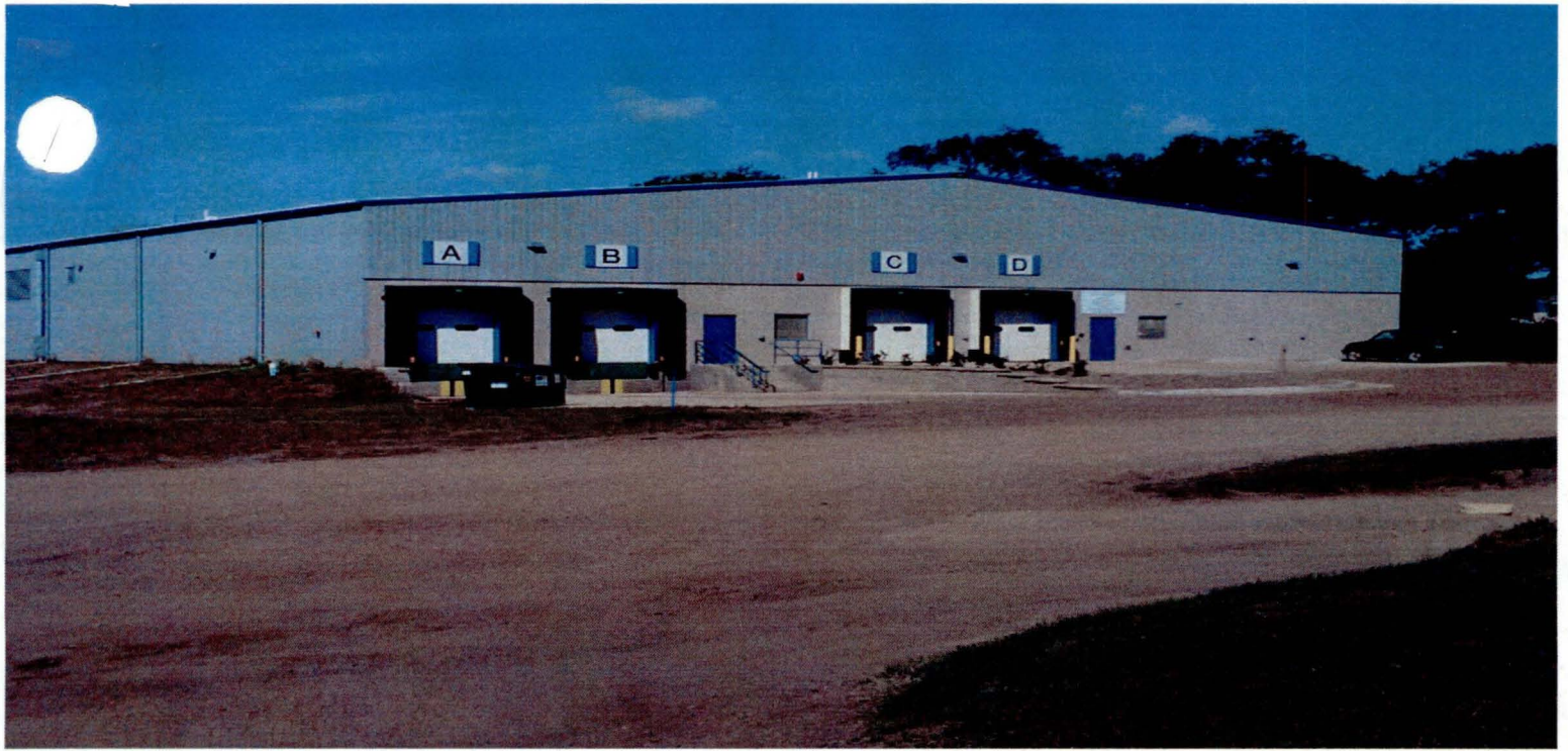
North Dakota State Penitentiary Warehouse