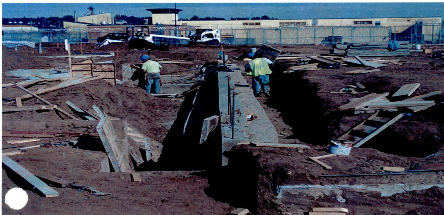
Construction inside Secure Perimeter (Cellhouse Footings / Foundations)