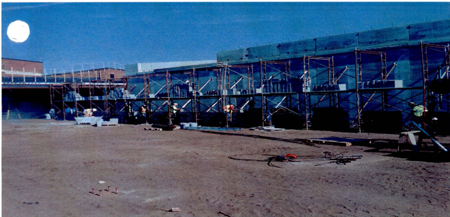
Construction inside Secure Perimeter (North Wall of New Construction)