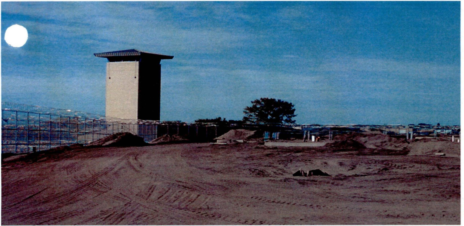
North Dakota State Penitentiary South Guard Tower