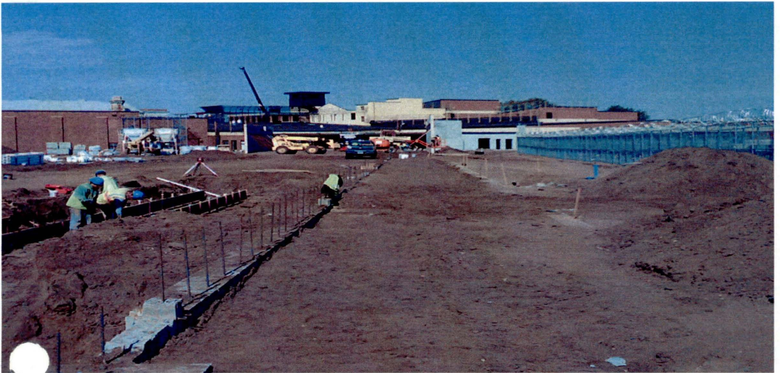
Construction inside Secure Perimeter (Looking NW – Future Main Street)