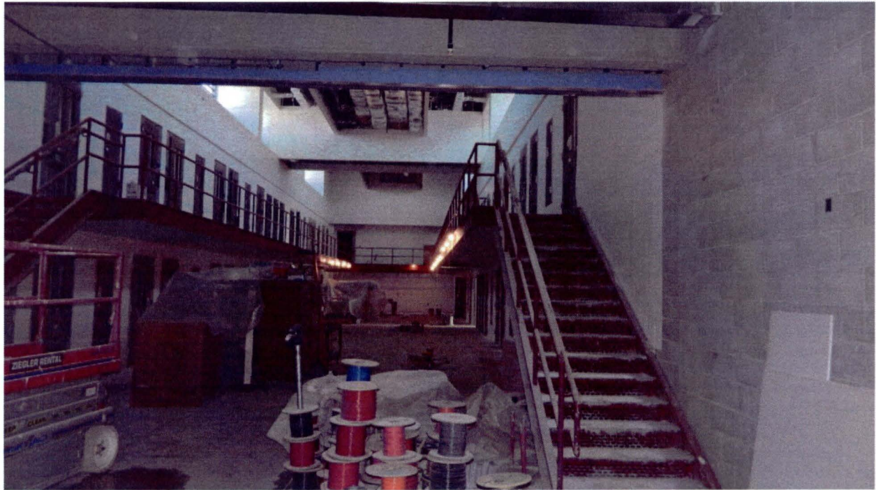
General population housing unit