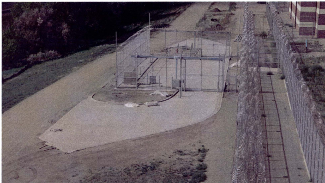
New arrival sallyport - located on South side of facility; view looking West