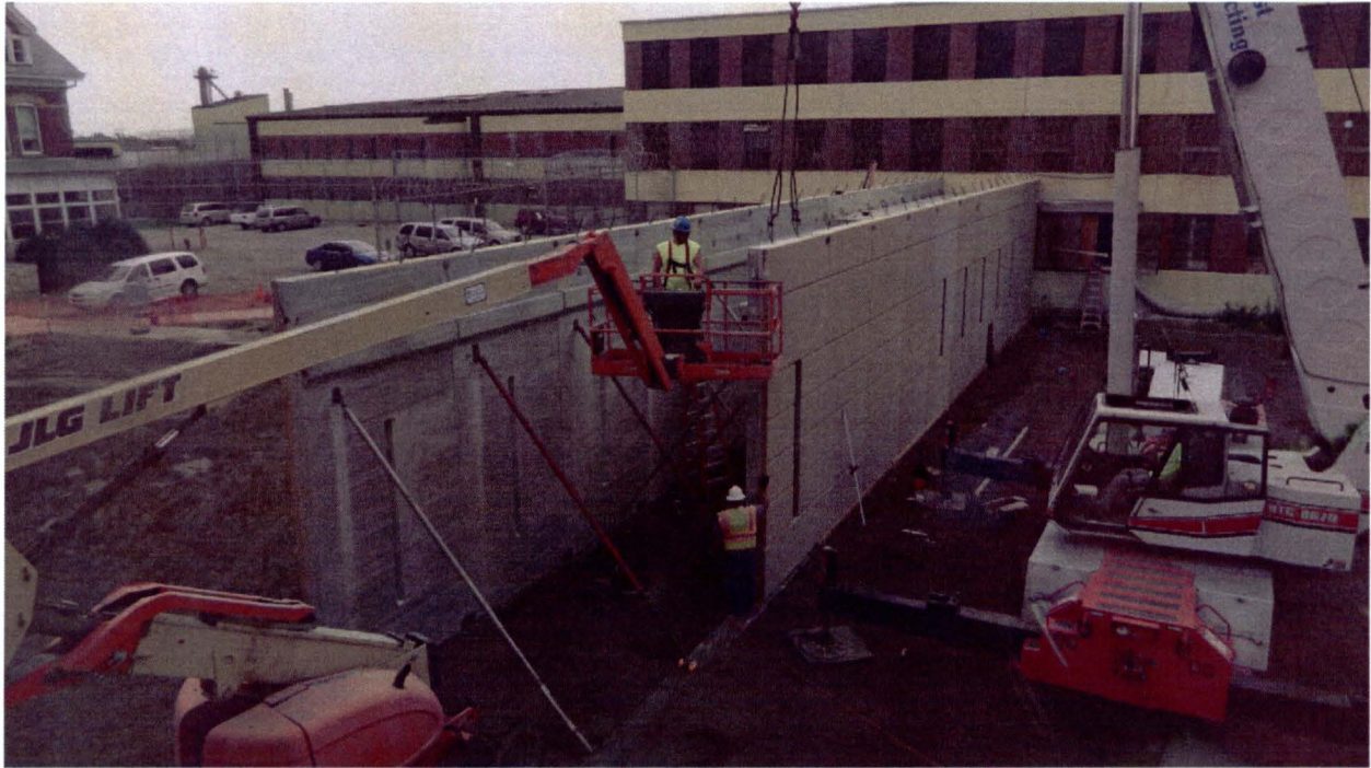
Connecting corridor between NDSP and DOCR Administration Building