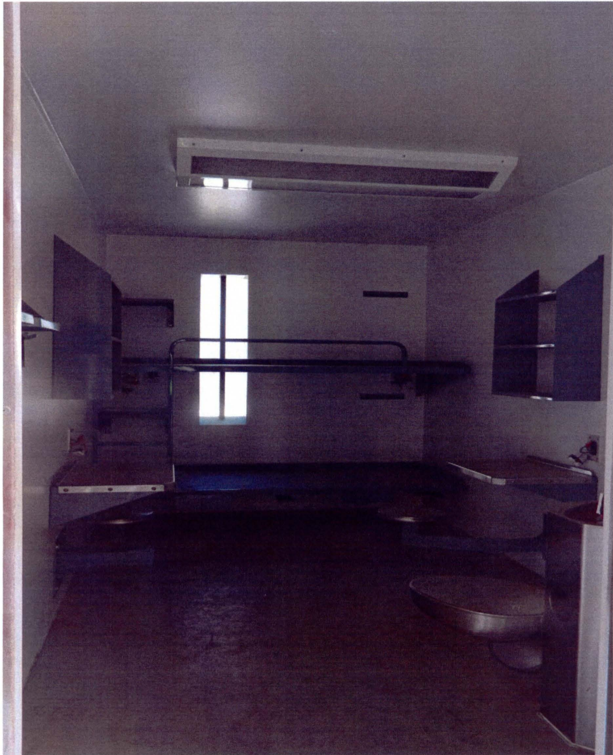
Double bunked cell – general population housing