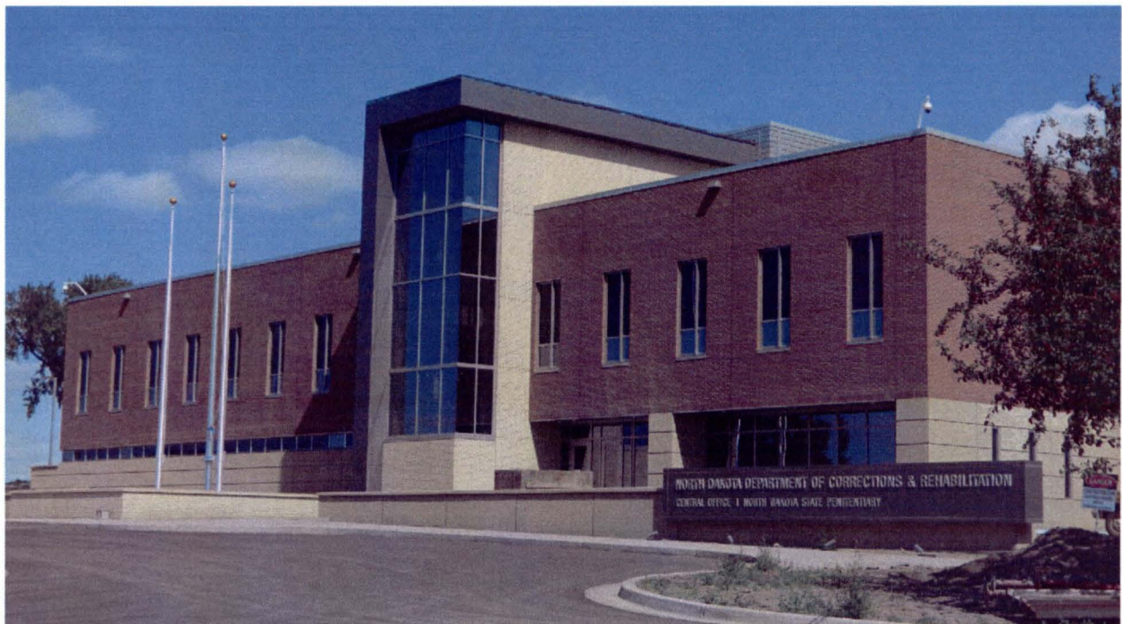
DOCR Administration Building