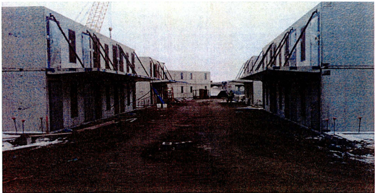
Orientation Housing (Looking SE – Interior View)