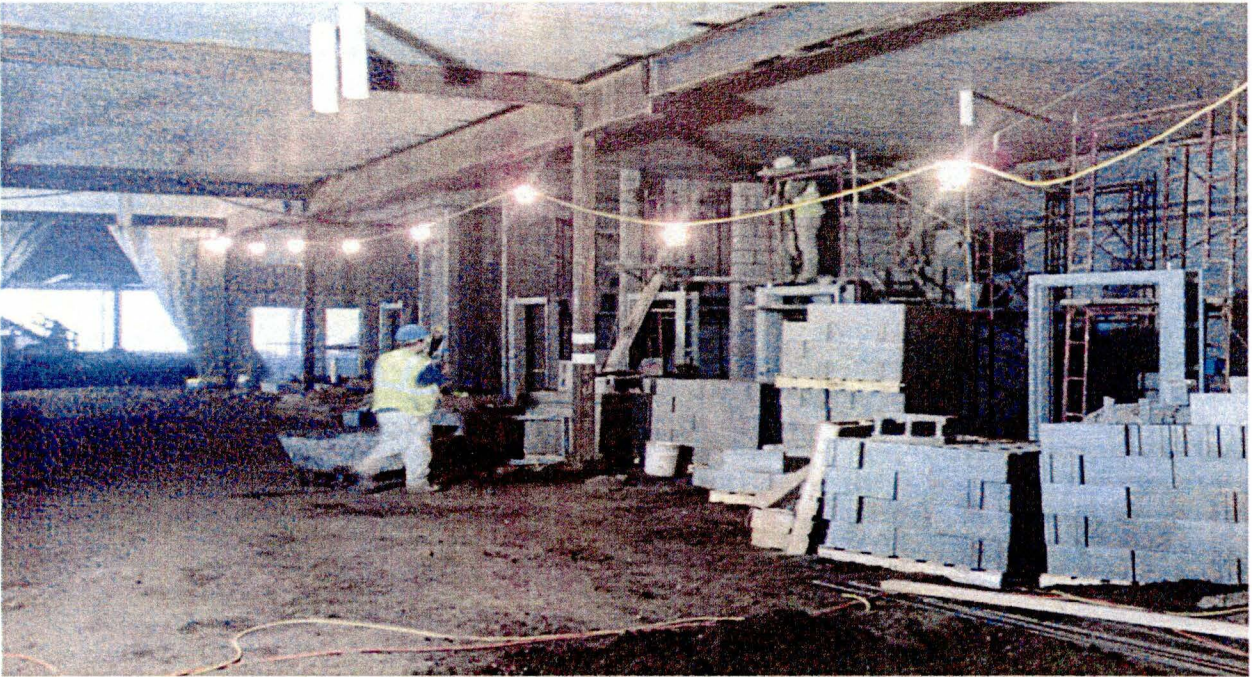
Medical Unit (Construction of Infirmary Cells)