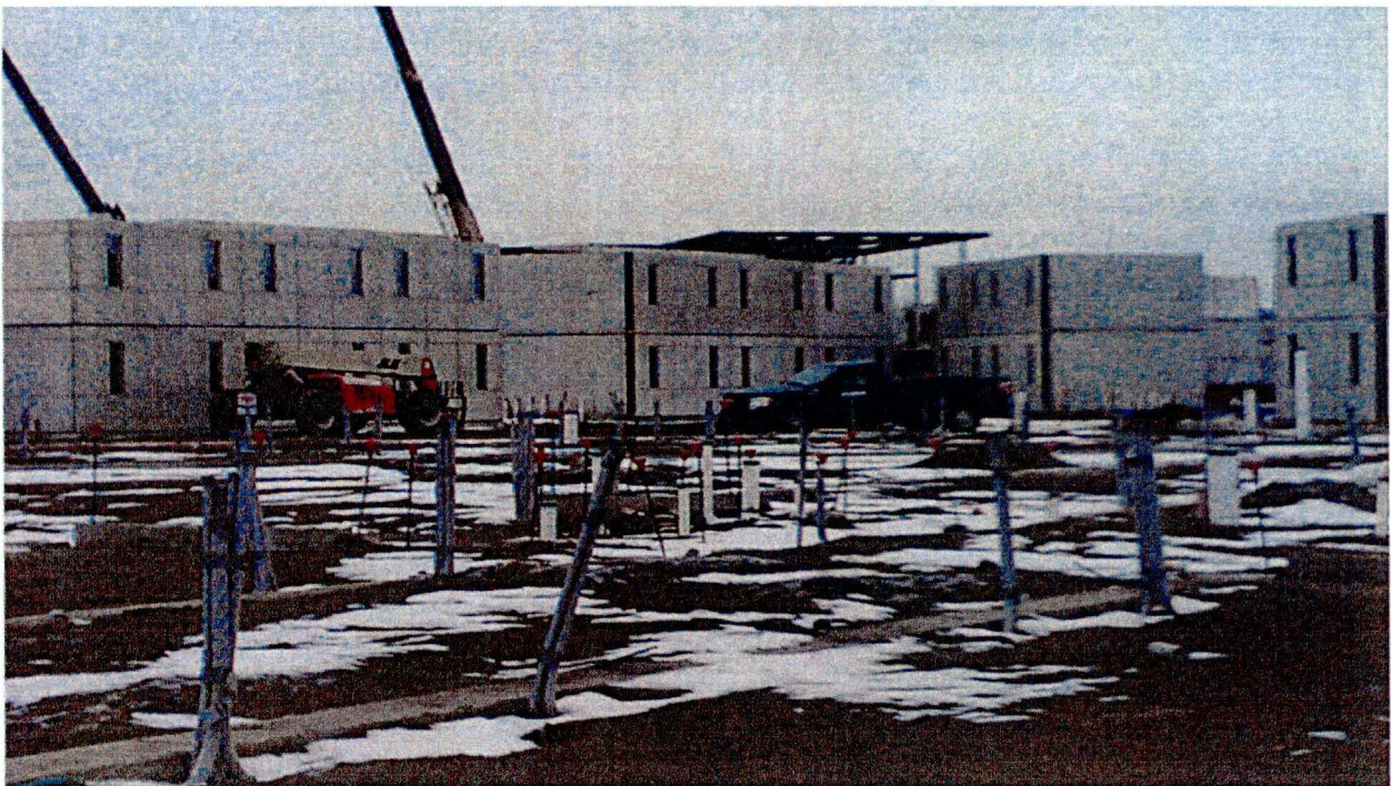
Precast Cell Houses (Looking NW – Exterior View)