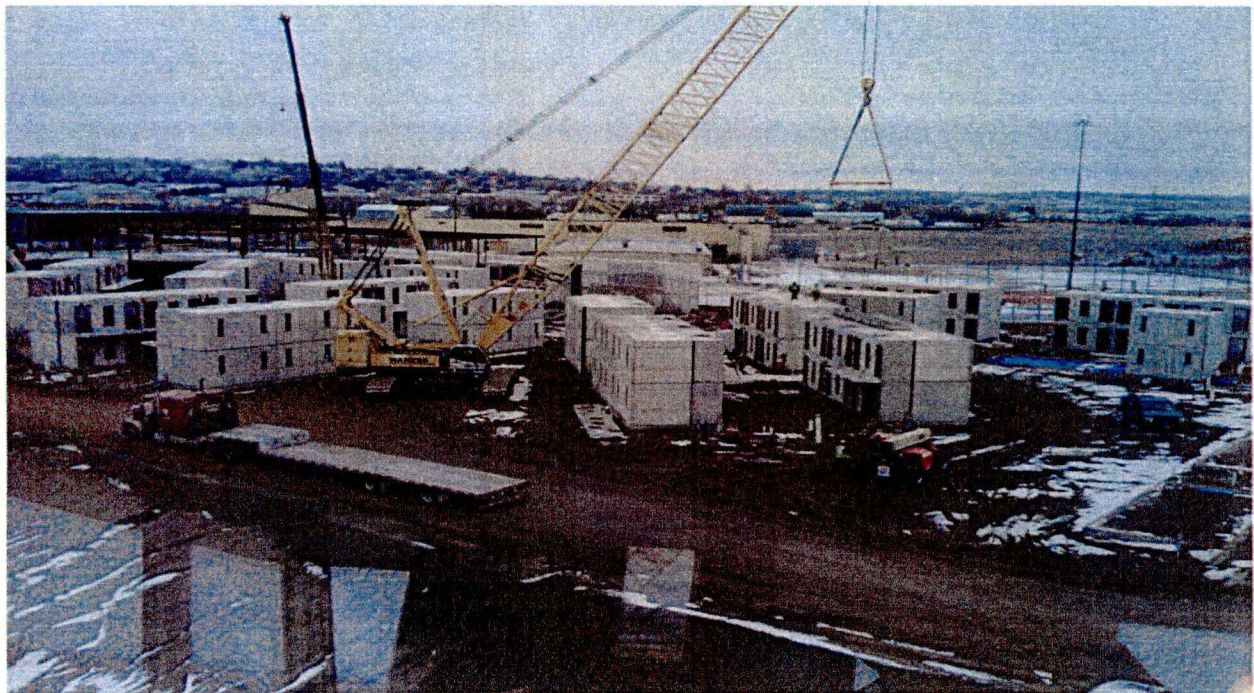
Precast Cell Houses (Looking NW – View from South Tower)