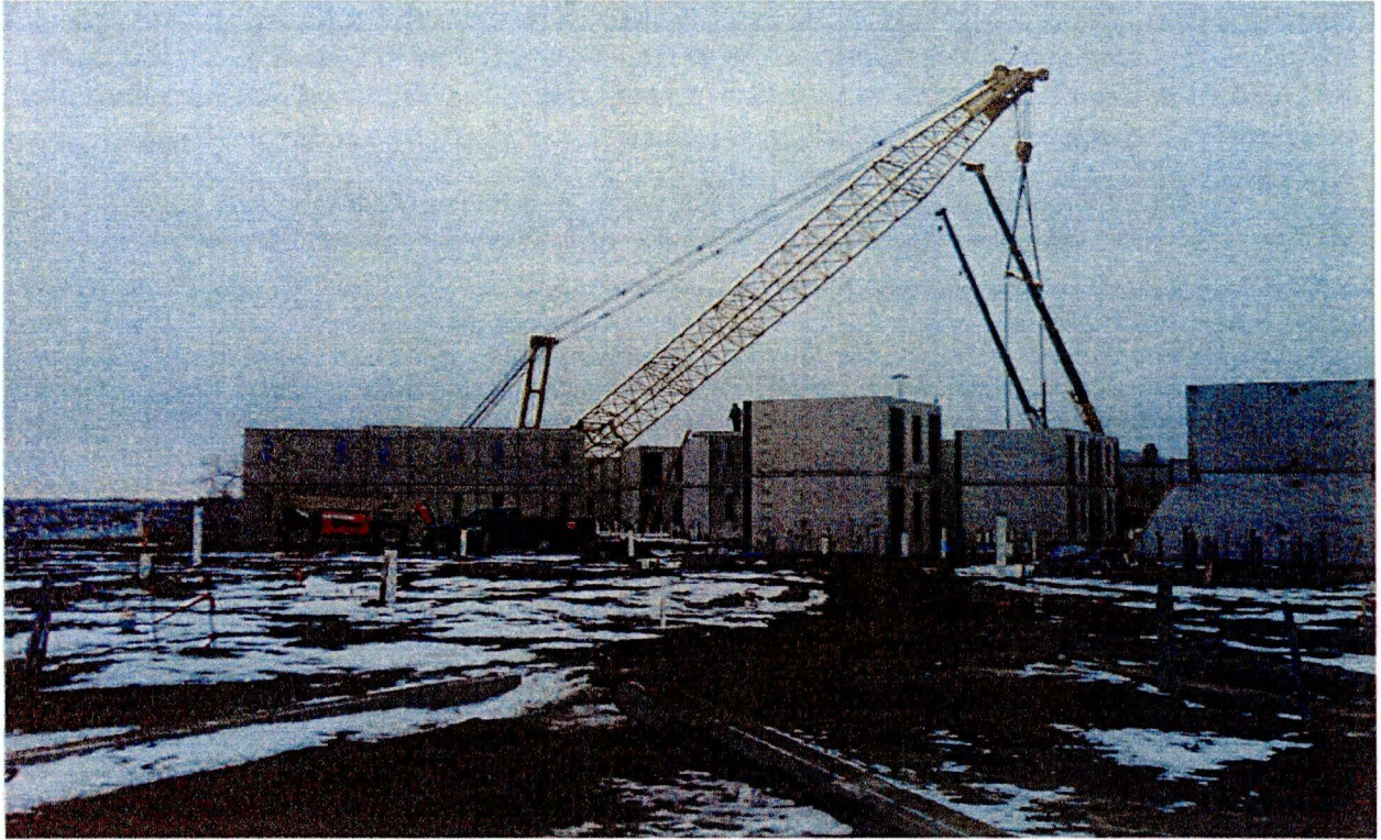
Setting Precast Cells (Looking West)