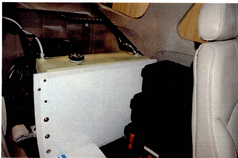
Ice Protection System