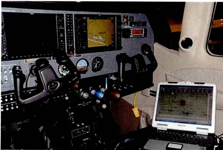
Cockpit Air Traffic Collision Avoidance System