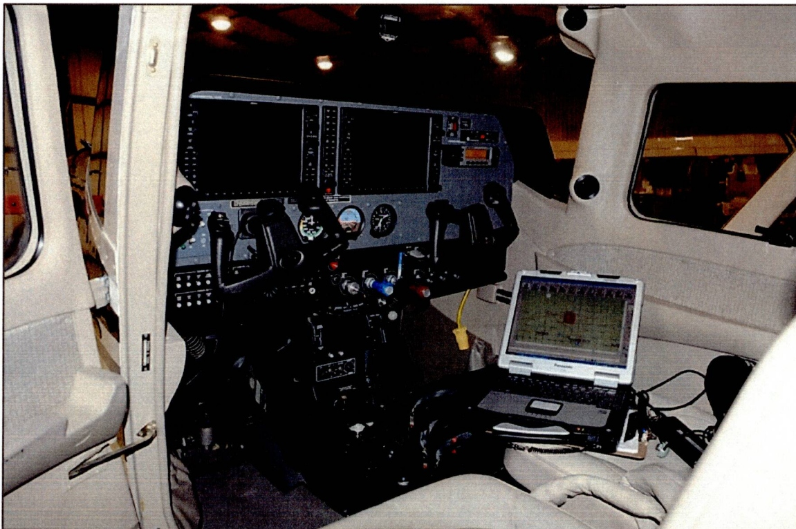
Cockpit Mobile Data Computer