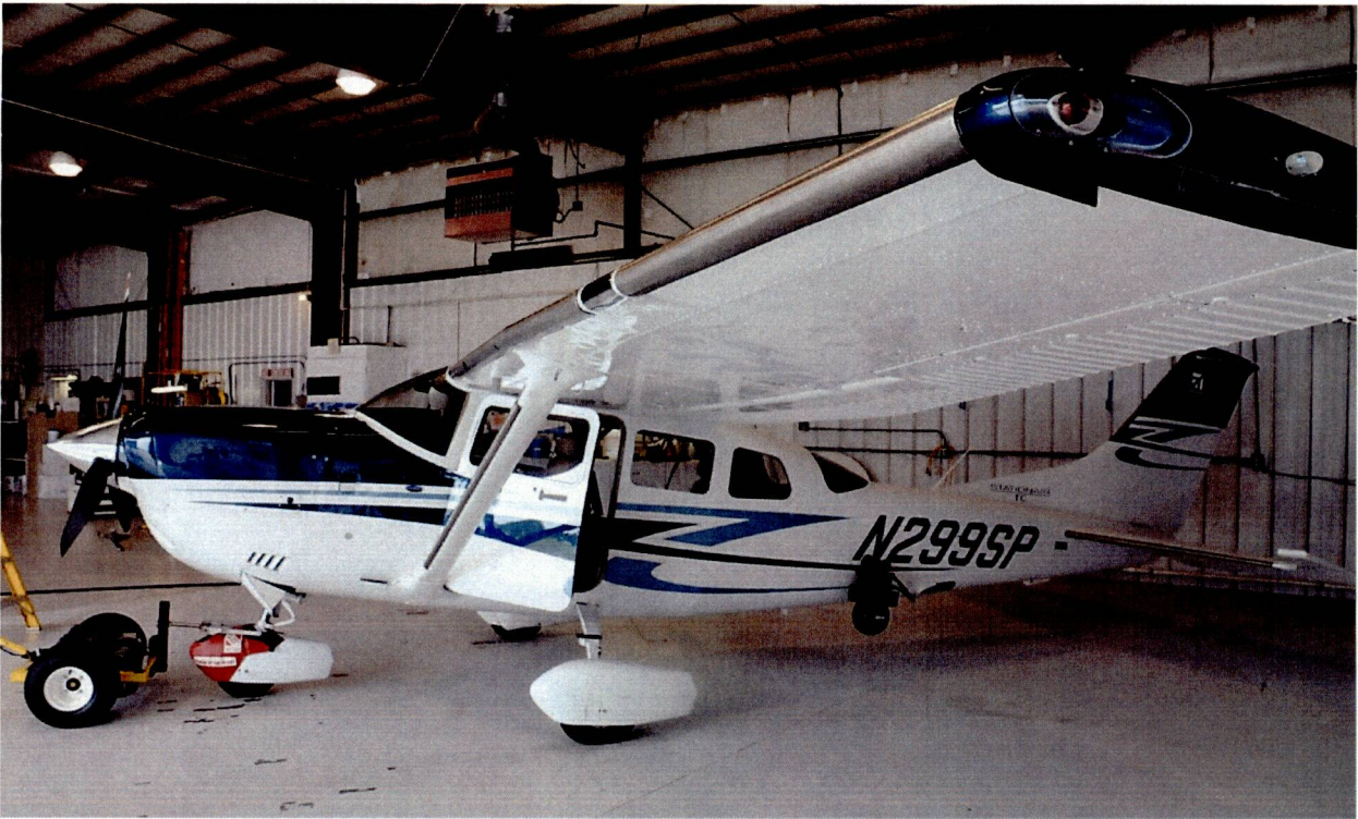
2007 Cessna T206