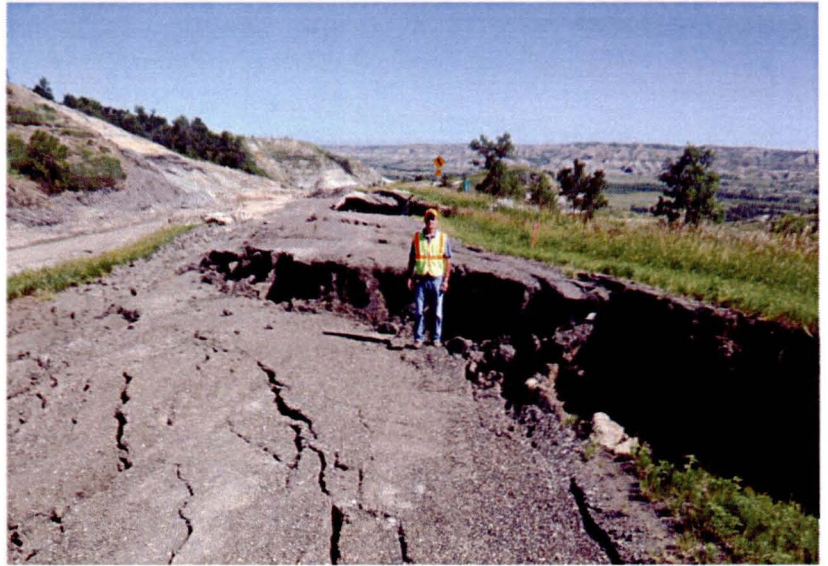
Photo shows - Dickinson District Engineer, Larry Gangl, in landslide area on ND Highway 22 north of Killdeer July 2011.