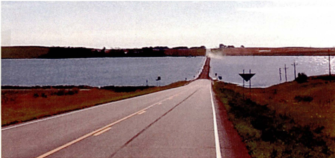
ND Highway 46 by Gackle

This concludes my testimony, thank you for the opportunity to appear before the committee today.