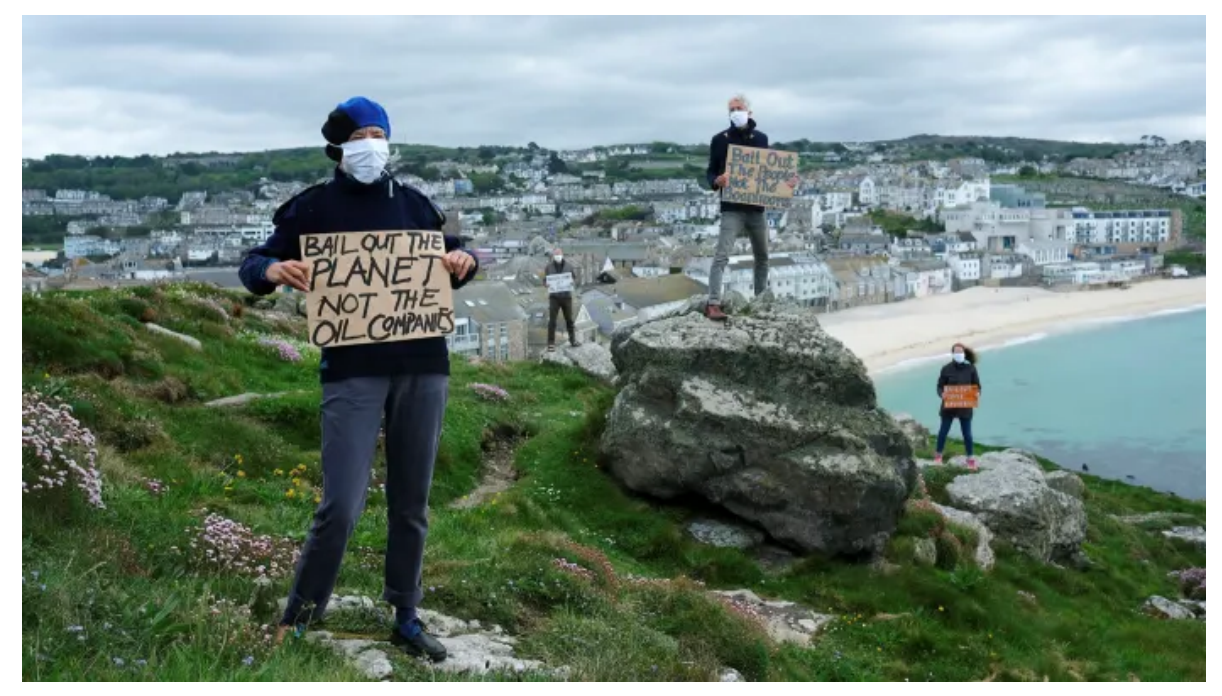
Activists in Cornwall. Environmental emergencies have pushed people to invest according to their values

Study of sustainable funds counters claims that ESG investment comes at the expense of performance