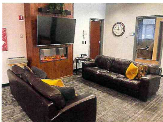
(Updated Student Commons Area)