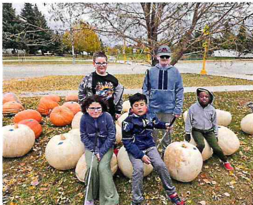
(Students explore the pumpkin patch)