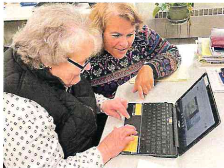
(Adult learning computer skills)