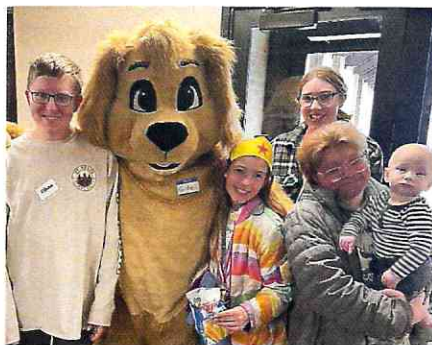
(Family Weekend fun)