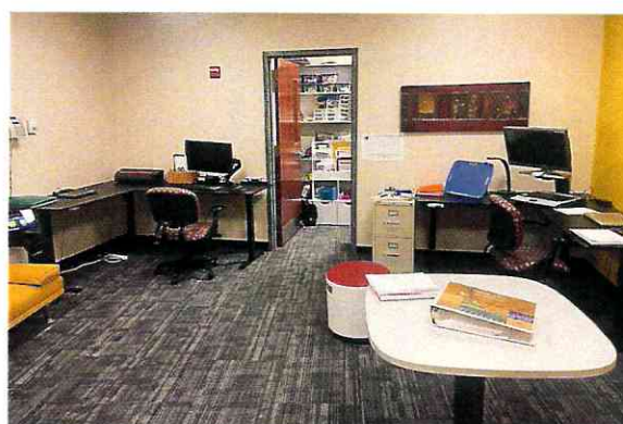
(Newly remodeled Instruction Room)