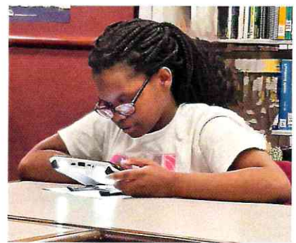
(Student using video magnifier)