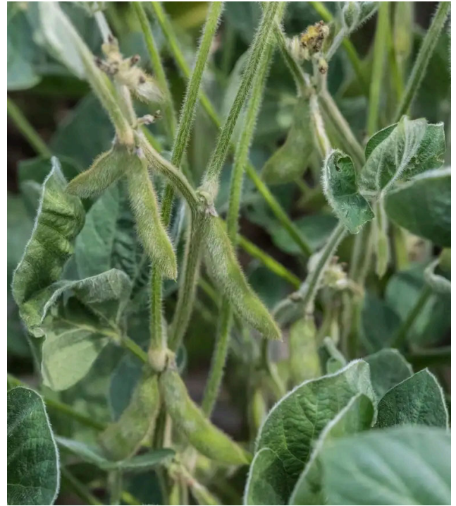
Soybeans with suspected dicamba damage north of Flatville, Illinois, on August 21, 2019. Millions of acres of non-dicamba tolerant soybeans have been damaged by dicamba.

Weeds cut into farmers' profits. With low profit margins, farmers will use any tool they can to control weeds.