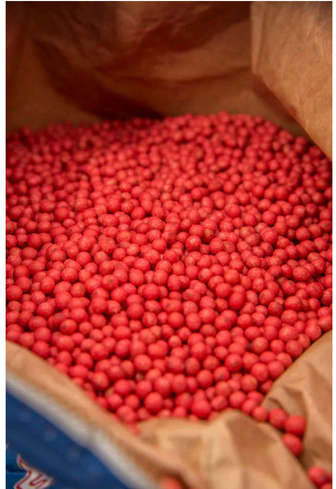
In 2018, about 41% of all soybeans planted were genetically modified to withstand dicamba. In 2019, 70% of cotton seeds planted were genetically modified to withstand dicamba, according to the EPA. File photo.

A Monsanto researcher wrote an email in February 2016 to his coworkers that underscored how little the company knew about the propensity of dicamba to damage crops.