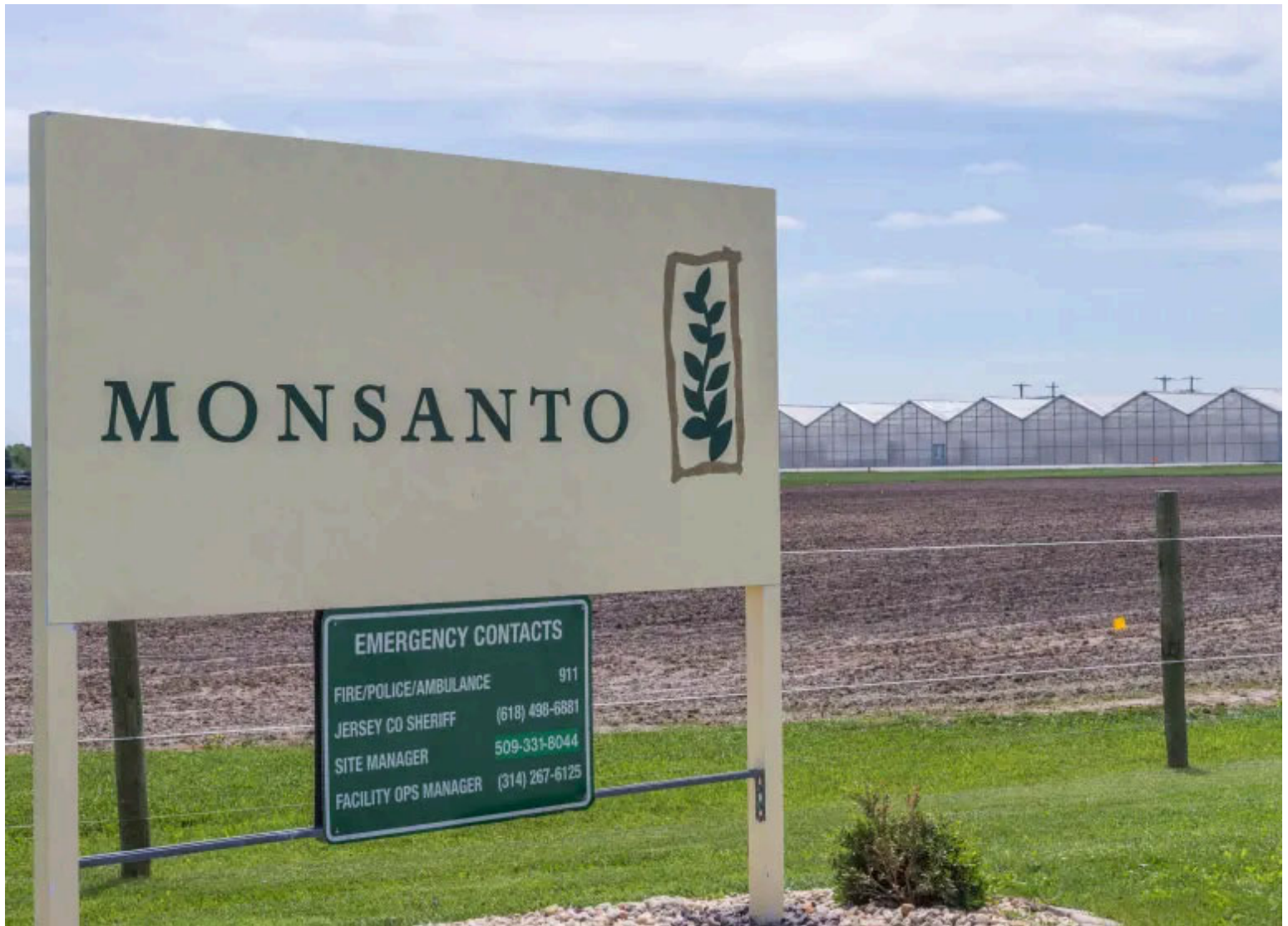
A Monsanto facility in Jerseyville, Illinois, in 2015. Monsanto, which was purchased by Bayer in 2018, released the dicamba-tolerant crops, beginning in 2015.