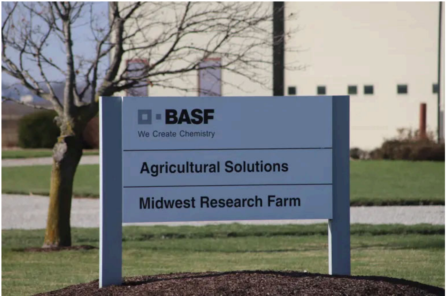
A BASF research farm near Seymour, Illinois, on Dec. 3, 2020. BASF released Engenia, a low volatility formulation of dicamba, beginning in 2017.