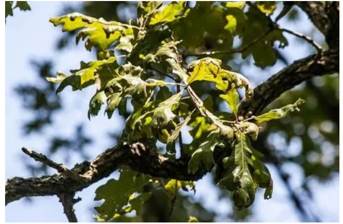
An oak tree exhibits symptoms of damage from dicamba documented by the Illinois Department of Natural Resources.

the Midwest Center reviewed thousands of pages of government and internal company documents released through lawsuits, sat in the courtroom for weeks of deliberation, interviewed farmers affected by dicamba and weed scientists dealing with the issue up close. This story provides the most comprehensive picture of what Monsanto and BASF knew about dicamba's propensity to harm farmers' livelihoods and the environment before releasing the weed killer.