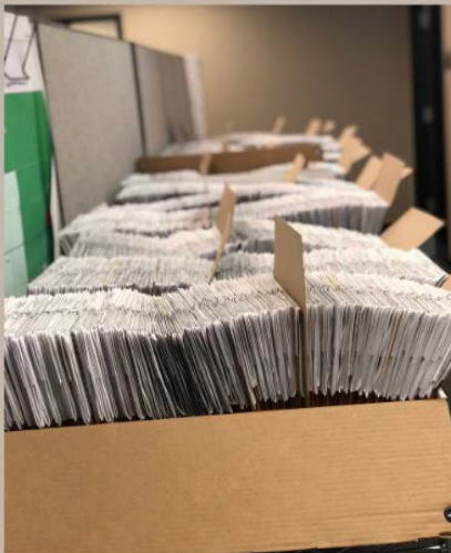
Picture depicts a portion of the ballots received

26,568 Ballots Mailed 12,438 Ballots Received