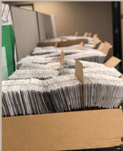
Picture depicts a portion of the ballots received

26,568 Ballots Mailed 12,438 Ballots Received