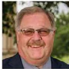
State Rep. Pat Heinort House Majority 6/19/2019 - Open