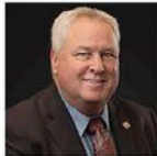
State Sen. Donald Schaible Senate Majority Legislative Assembly Member 6/20, 2023 - Open