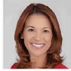
Kirsten Baesler State Superintendent of Public Instruction 9/5/2019 - Open