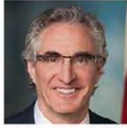
Gov. Doug Burgum 9/5/2019 - Open