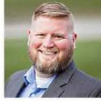
State Sen. Ryan Braunberger Senate Minority Legislative Assembly Member 6/20/2023 - Open